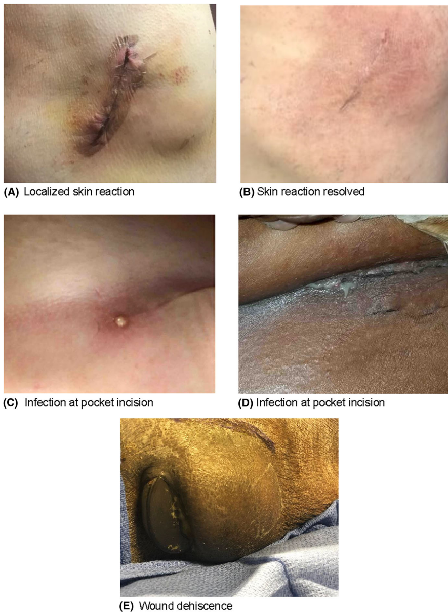
FIGURE 2 Examples of infection and non-infection reactions at S-ICD implant sites. A, Noninfection localized skin reaction at 5 days post-implant. B, Same site as in (A) at 14 days. (Photo credit: George Mark, MD, FACC, FHRS, Cooper University Hospital). C, Pocket infection. 36-year-old woman with congenital heart disease two weeks postimplant. The superficial infection resolved with oral antibiotics without the need for device removal. (Photo credit: Bridget Loftus, RN, Northwestern Memorial Hospital). D, Pocket infection. 56-year-old woman with morbid obesity and heart failure fifteen days postimplant. There were no systemic symptoms. The infection resolved, and the incision healed with local wound care measures without the need for antibiotic therapy or device removal. (Photo credit: Jeremiah Wasserlauf, MD, MS, Northwestern Memorial Hospital). E, Wound dehiscence with negative blood culture and positive wound culture for methicillin-susceptible Staphylococcus aureus ; device explanted four months after implant. Prior TV-ICD infection with bacteremia and endocarditis followed by device explantation 2 years prior to S-ICD implant. (Photo credit: Marc A. Miller, MD, Icahn School of Medicine at Mount Sinai)