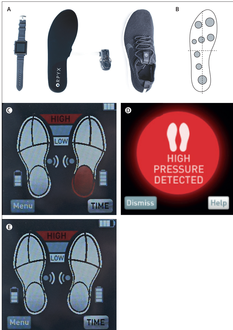
Figure 1: SurroSense Rx intelligent insole system (Orpyx Medical Technologies, Calgary, AB, Canada)

(A) Intelligent insole system, comprising 0.6 mm flexible, pressure-sensing inserts (placed underneath the patient's own orthotics or insoles) and a connecting smartwatch. (B) Sites of the pressure sensors: first metatarsal head [one sensor], lateral metatarsal heads [two sensors], hallux [one sensor], lateral toes [one sensor], lateral foot [two sensors], and heel [one sensor]. (C–E) Smartwatch screen displaying a user-friendly, visual foot map, highlighting areas of high pressure. The device integrates pressure data over time and uses this to generate alerts for the user. The user must respond to the alert by offloading the area of high pressure on their foot; the watch will continue to provide alerts until the pressure has been offloaded.