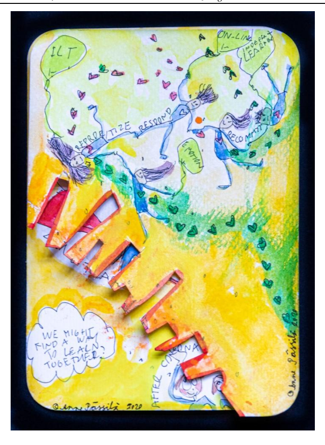
Figure 2(b) Glocalisation