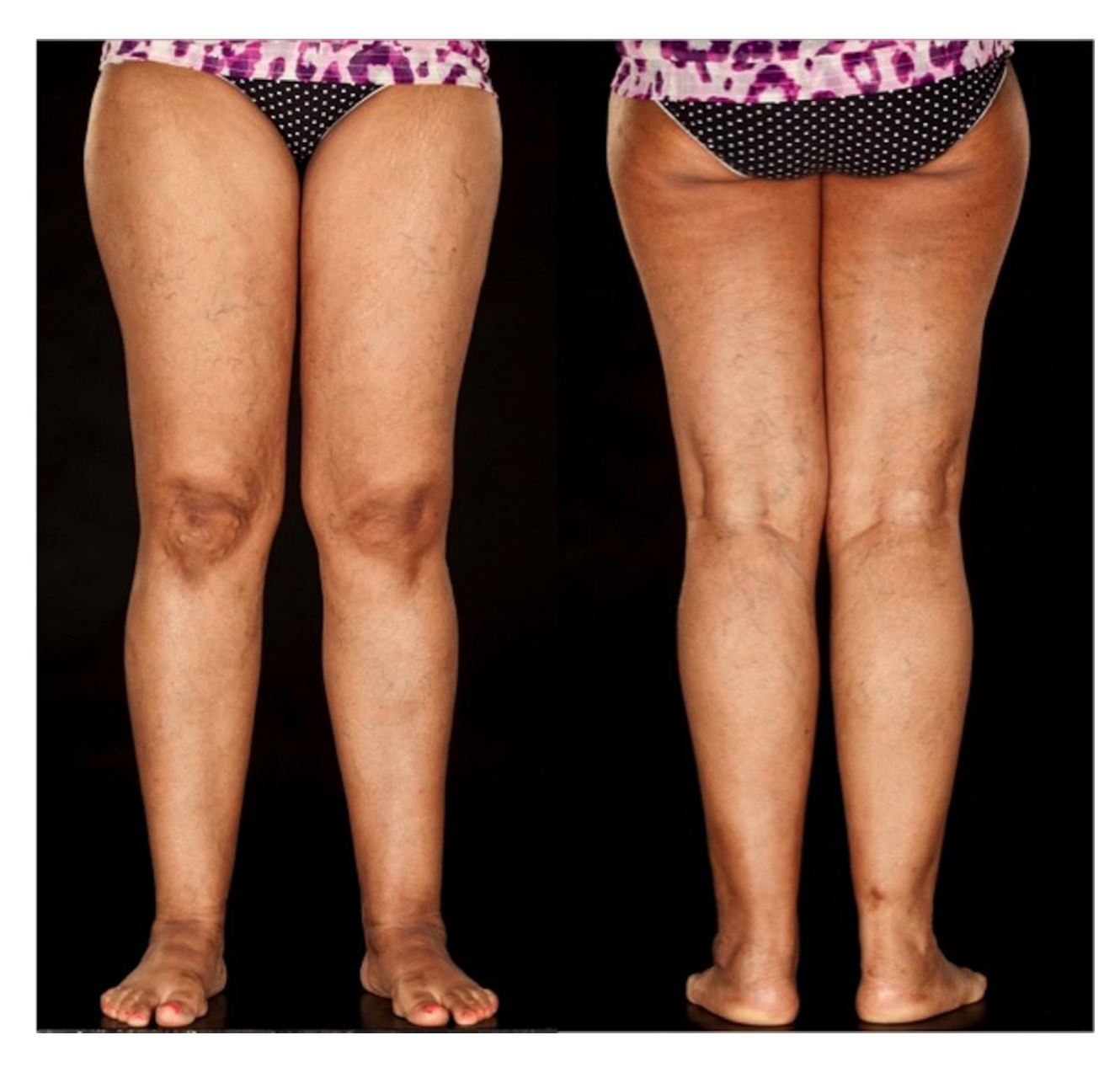
Figure 4. 48 year-old patient showing lower limbs are spared from lipoatrophy