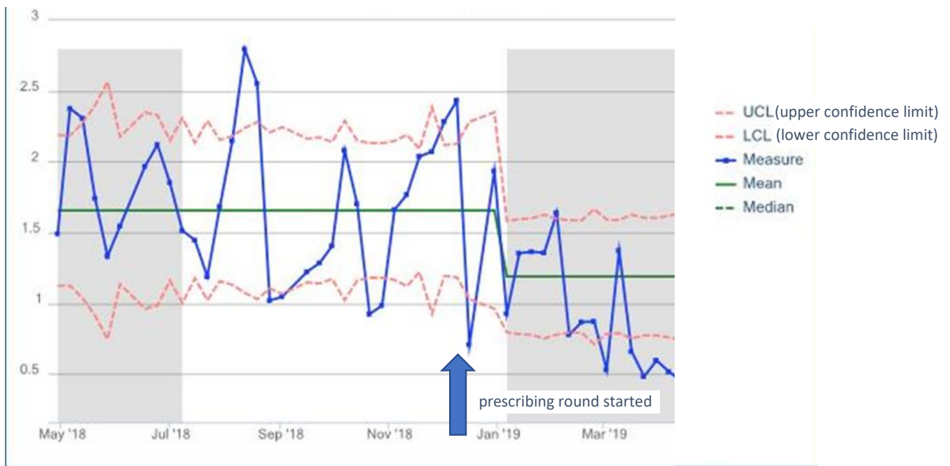
Figure 1. PICU total prescription errors per bed day