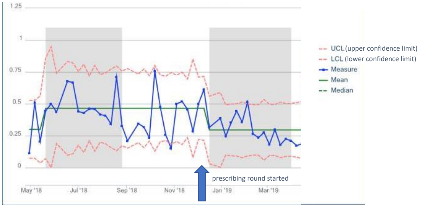
Figure 2. PICU clinical prescribing errors per bed day