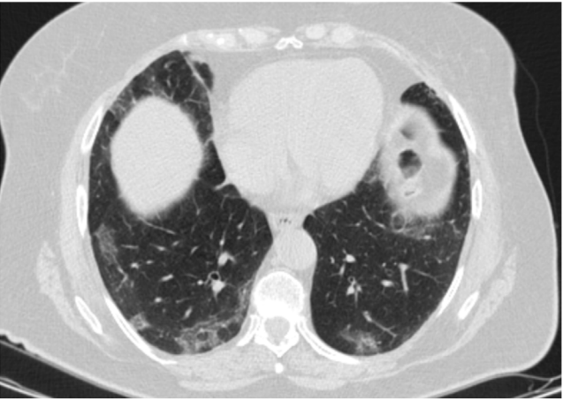
Fig. 1. Chest CT images showing bilateral ground glass opacities.

cell/L, lymphocyte count was 1.15×10<sup>9</sup> cell/L, C-reactive protein level was 13.85 mg/L (normal range <1 mg/L). Liver function, renal function, myocardial enzymes and electrolytes were normal (Annex 1). Legionella and Pneumococcal urinary antigen, Chlamydia and Mycoplasma serology were negative. Two oropharyngeal swab tested negative for SARS-CoV-2 by qualitative real-time reverse-transcriptase-polymerase-chain-reaction (RT-PCR) at hospital admission (17 days from symptoms onset) and a day apart. According to chest HRCT findings and persistent fever, a Bronchoscopy was performed (19 days from symptoms onset) with RT-PCR for SARS-CoV-2 positive result in BAL fluid. The patient has been treated according to local protocol at that time, with symptomatic and antiviral therapy including lopinavir/ ritonavir. Seven days after admission patient's respiratory symptoms improved and she was discharged in community after collection of two negative oropharyngeal swab tests.