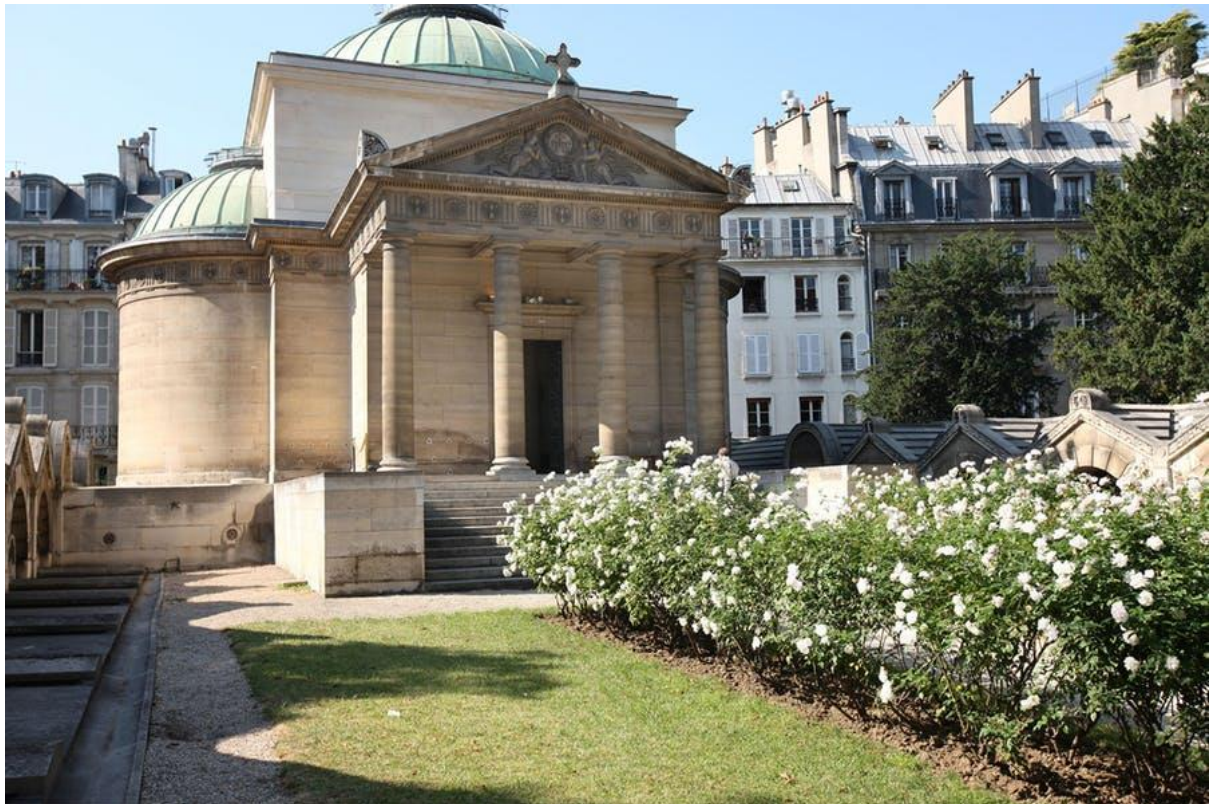
The Chapelle Expiatoire (chapel of atonement) in Paris.