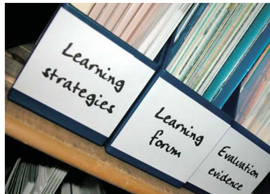
Files on display in a project school

"You can't be growing all the time. There are ebbs and flows: when you get into a new school year; after a few weeks; the beginning of a new term; the end of term tidying up and rewards and satisfaction... There are phases when you have spurts, or when you chill out, or when the waters are distinctly choppy."