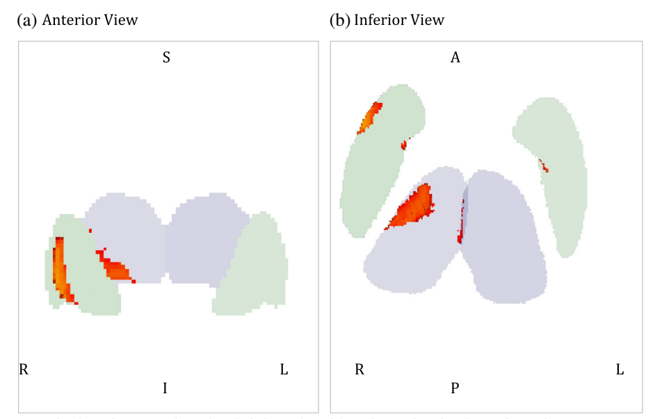
FIGURE 3 Legend: Bilateral Putamen (green) and Thalamic (purple) masks overlayed with significant clusters PwP + C versus PWP-C. A, anterior; I, inferior; L, left; P, posterior; R, right; S, superior. All significant clusters indicate increase in PwP + C group (see colour bar). TFCE, FWE p < .05

p < .05 Enlargement of first group p = 0p < .05 Deflation of first group p = 0