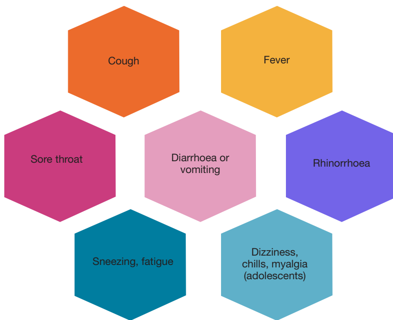
Figure 1. Common clinical manifestations of symptomatic COVID-19 infection in children.