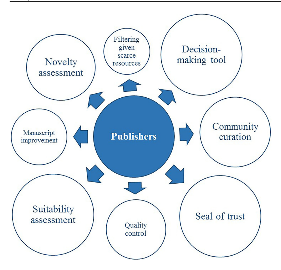
Figure 3 Publishers' expectations.