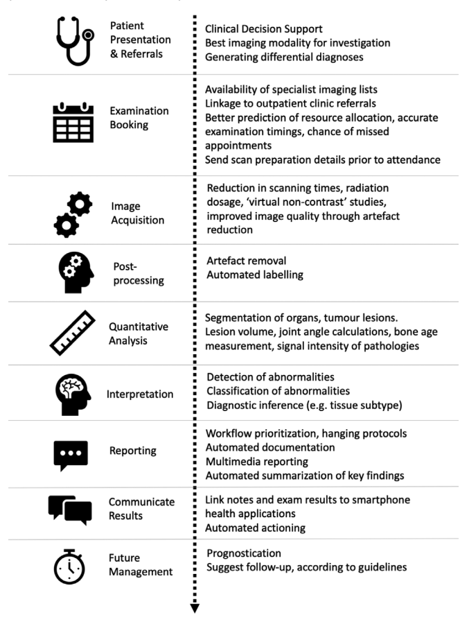
Figure 1. Diagram depicting the patient pathway from hospital admission to radiology report and follow-up, with summary of how artificial intelligence tools may enhance clinical practice and patient experience.

for a renal ultrasound referral within 6 weeks, rather than a CT abdomen).<sup>8,9</sup>