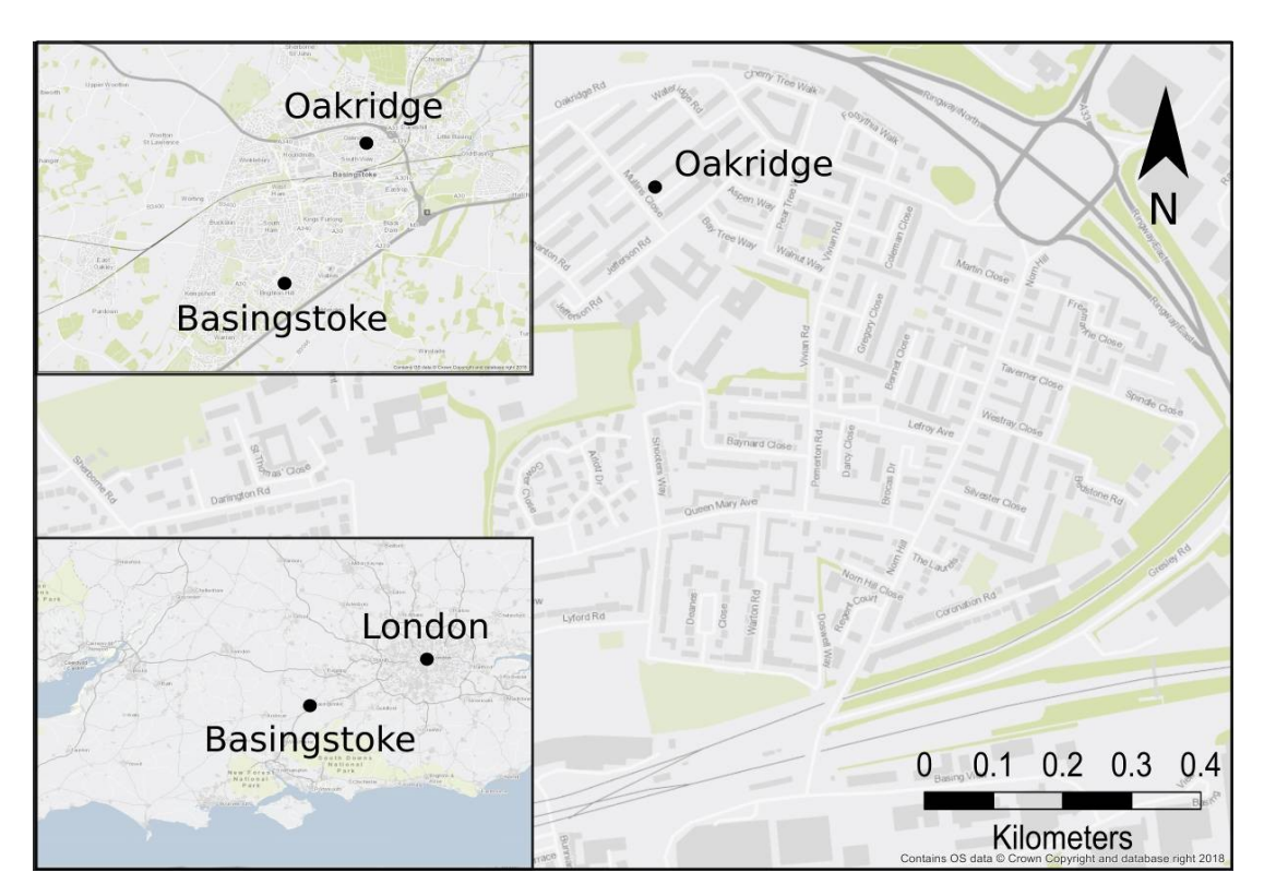
Figure 1. Location of Oakridge at Basingstoke, Hampshire, England (figure by G. Cole).