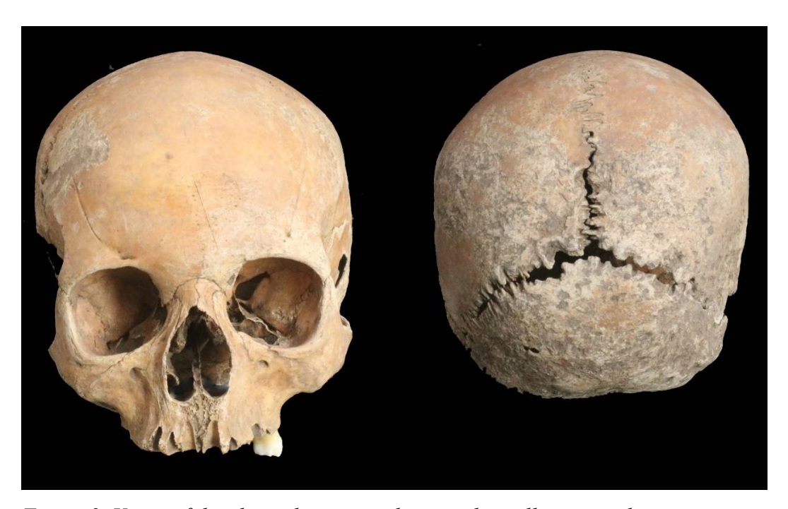
Figure 2. Views of the cleaned cranium showing the well preserved anterior aspect and the degraded posterior aspect.