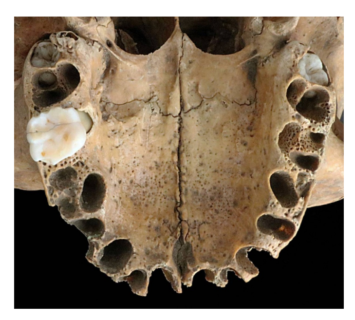
Figure 3. Occlusal view of the maxilla, showing the erupted left first molar. The third molars are visible in their crypts.