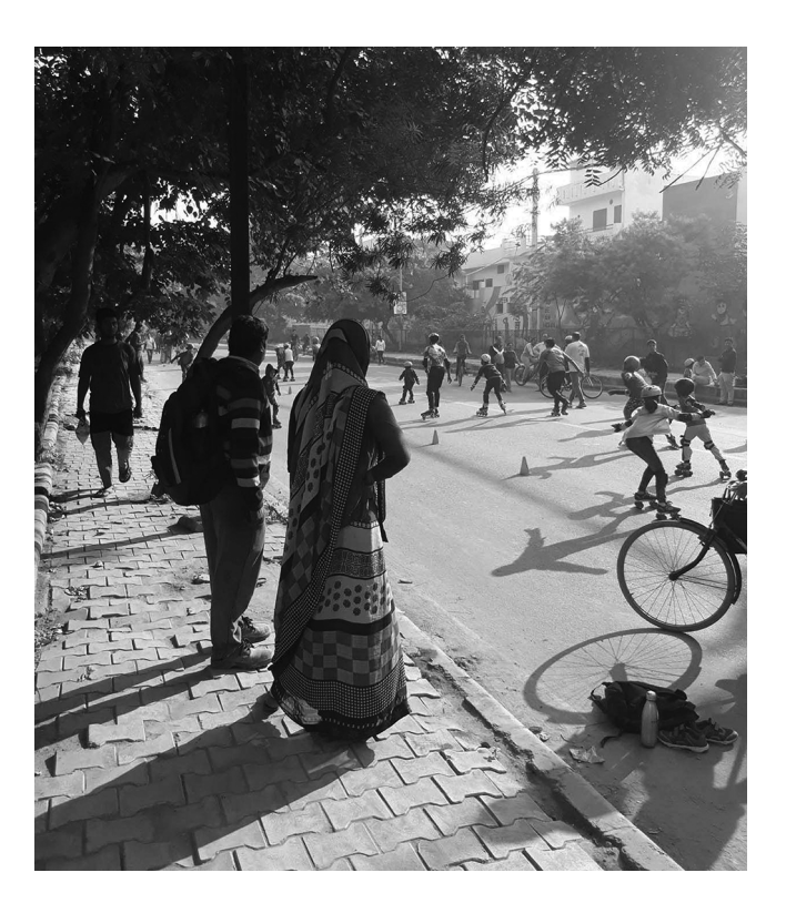
Figure 4: Raahgiri and its Others.

Raahgiri is one of several sites where ideas of ordinary citizenship and "the people" are being redefined in the postliberalization period. It acts, as I suggest in the concluding section, as a counterpoint to the ordinariness staged at Shaheen Bagh. Historically, the Neh-