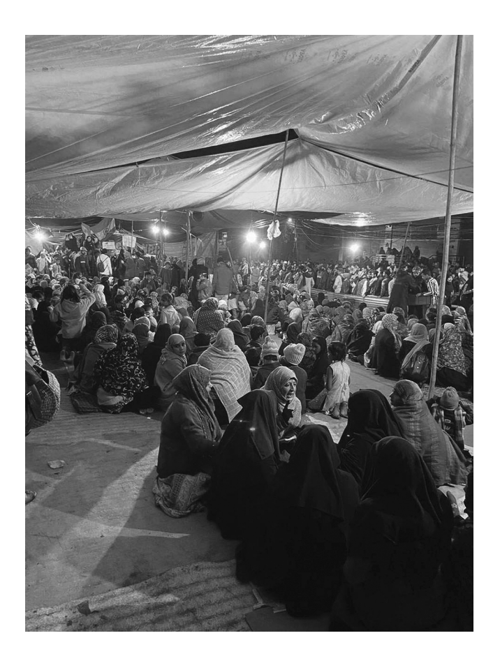
Figure 1: Protesters at Shaheen Bagh.

The popular sentiment that "something" has changed since the formation of the two BJP-led governments (in 2014 and 2019) has taken strong root. However, just as palpably, there is the perception that "ordinary' citizens"—such as those at Shaheen Bagh—have begun to raise their voice against the dilution of constitutional ideals that, putatively, guide the conduct of governance and relationships between the state and its citizens. "Constitutional values" and their defense by "ordinary"