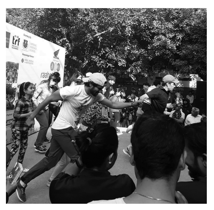
Figure 3: Raahgiri participants, Gurgaon.

Further along, there is a mini soccer ground, sponsored by a local soccer coaching business. It displays the banner of a European football club that has a tieup with the company. Groups of children are also playing badminton. Along various footpaths, there are small billboards of various corporate sponsors. Among them there are some that say " Hindustan Times Raahgiri," while others proclaim " Times of India Raahgiri." Other groups have also joined in the crowds taking part in aer-