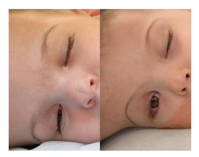
Figure 3: Lagophthalmos appreciated in right eye of both twins under general anaesthesia. Twin 1 (left) displayed right lagophthalmos of 3 mm whereas Twin 2 (right) displayed right lagophthalmos of 6 mm.

At initial ophthalmic examination, we noted that right brow position in each twin was abnormally high due to scalp shortage. Both twins were visually alert, fixing and following well, making eye contact, responding to smiling and demonstrating age appropriate behaviour. Binocular visual acuity (VA) was measured by forced-choice preferential looking using Keeler Acuity Cards (Keeler Ltd, Windsor, UK). VA fell within normal limits for