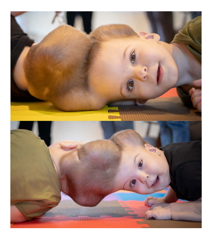
Figure 2: Tissue expansion performed to enable separation and craniofacial reconstruction.

At initial ophthalmic examination, we noted that right brow position in each twin was abnormally high due to scalp shortage. Both twins were visually alert, fixing and following well, making eye contact, responding to smiling and demonstrating age appropriate behaviour. Binocular visual acuity (VA) was measured by forced-choice preferential looking using Keeler Acuity Cards (Keeler Ltd, Windsor, UK). VA fell within normal limits for