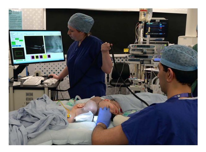
Figure 4: Handheld OCT acquisition. OCT image acquisition in lateral decubitus position under general anaesthesia using handheld OCT device.

corrected age in both twins (Twin 1: 6.4 cycles/degree; Twin 2: 4.7 cycles/degree) [5]. Due to the twins' position, both lying on their right sides in bed, cards were held horizontally and vertical eye movements used as responses, then rotated vertically for confirmation of responses towards threshold. Eye movements were full. There was no relative afferent pupillary defect in either twin.