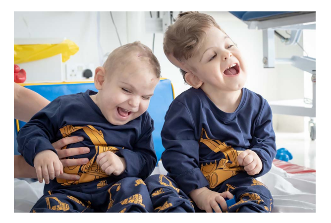
Figure 6: Twins post-separation. Twins post-separation taking part in physiotherapy.

QDS and sodium hyaluronate 0.2% eye drops Q2H, to both eyes, resulting in clear corneas within 2 weeks.