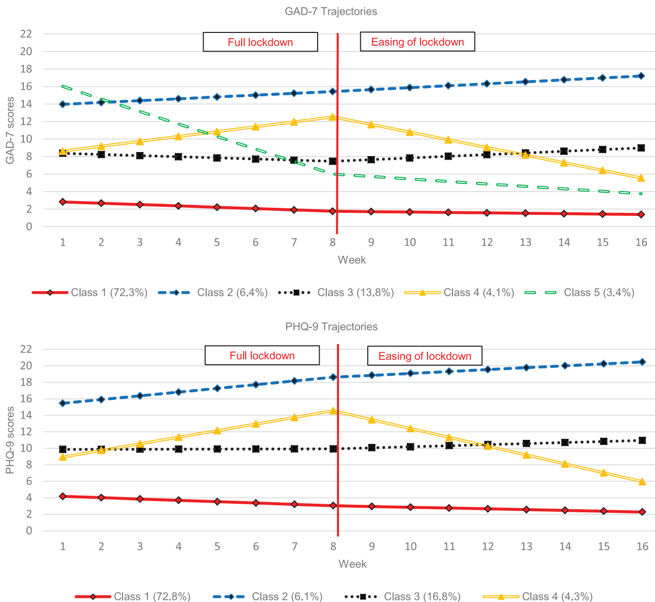
Fig. 1. GMM class solution trajectories (GAD-7 and PHQ-9).

16 weeks of national lockdown in England, with further improvements over time. However, a considerable number (27–28%) reported scores suggestive of likely clinical disorder in the initial weeks of lockdown, and for some people these symptoms did not reduce over time. The easing of national restrictions was associated with observable decreases in symptoms for a small group of participants (around 4%) in both the anxiety and depression symptom analyses, although the speed at which symptoms decreased appeared slow after the easing of lockdown. Additionally, one group of participants experienced observable increases in symptoms even after the easing of lockdown. A number of participant characteristics were associated with being in these different trajectories, and notably being younger, having a previous mental health diagnosis, or a physical health condition, were associated with a lower likelihood of being in the low symptom severity subgroup.