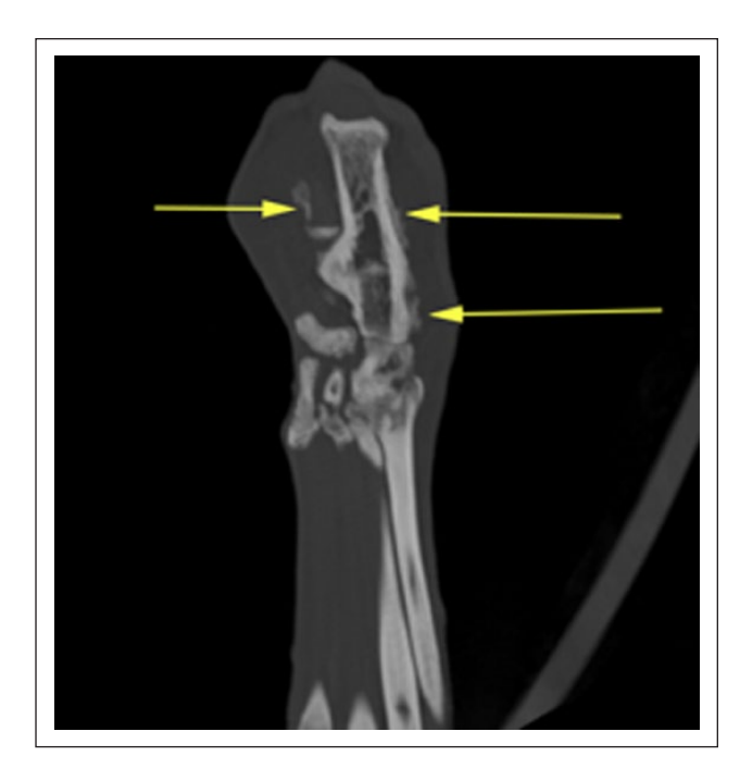
Figure 1 Dorsal multiplanar reformatted image of the left tarsus of case 1. A moderate periosteal reaction as described is identified (arrows)

around the talocrural joint (Figure 1). The lesion appeared intimately associated with the synovium. There were multiple pockets of non-contrast-enhancing soft tissueattenuating material within the mass. CT of the chest revealed consolidation of the ventral aspect of all lung lobes. The consolidation occupied up to approximately two-thirds of each lung lobe. Air bronchograms were identified at the dorsal aspects of the regions of consolidation. The tip of the left cranial lung lobe was characterised by emphysematous changes. There was scant heterogeneous mineralisation of the lateral aspects of the right caudal lobe. There was also a mild tracheobronchial lymphadenopathy. These changes may have been consistent with previous severe liquid paraffin aspiration; however, concurrent disease (mycobacterial pneumonia) was also possible.