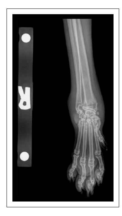
Figure 5 Dorsopalmar radiograph of the right antebrachiocarpal joint of case 4. There is marked soft tissue swelling associated with the antebrachiocarpal joint, as well as a smooth periosteal reaction along the distal radial metaphysis on the medial and lateral aspects. Focal regions of osteolysis are present within the medial aspect of the distal radial epiphysis

positive for M tuberculosis complex, confirmed to be M microti on GenoType MTBC assay (Leeds Teaching Hospitals Trust, Department of Microbiology).