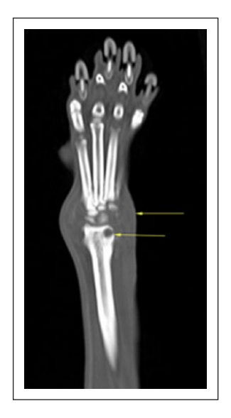
Figure 3 Dorsal multiplanar reformatted image of the left carpus of case 2. There is marked soft tissue swelling identified associated with the antebrachiocarpal joint (arrow). Smooth periosteal new bone is identified along the medial aspect of the distal radius. Marked osteolysis is identified, and particularly obvious in the lateral aspect of the distal radial epiphysis (arrow)

within the distolateral aspect of the radius and the intermedioradial carpal bone consistent with osteolysis. Differential diagnoses included osteomyelitis/erosive arthritis (fungal, bacterial), atypical immune-mediated arthritis, mycobacterial infection and soft tissue neoplasia (eg, synovial cell sarcoma). CT of the right carpus was unremarkable. Enlargement of the left axillary lymph node was noted on CT, which was thought to be consistent with reactive or metastatic change. CT of the thorax revealed no abnormalities.