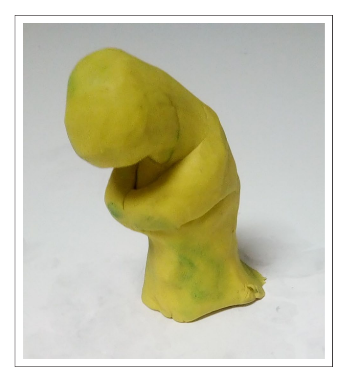
Figure 3. Plasticine model of 'a sad and frustrated doll'.

Among both sets of plasticine models that students made (depicting how they saw themselves and how others viewed them), there were no portrayals of students as powerful and entitled consumers. Indeed, some students made models to represent how they