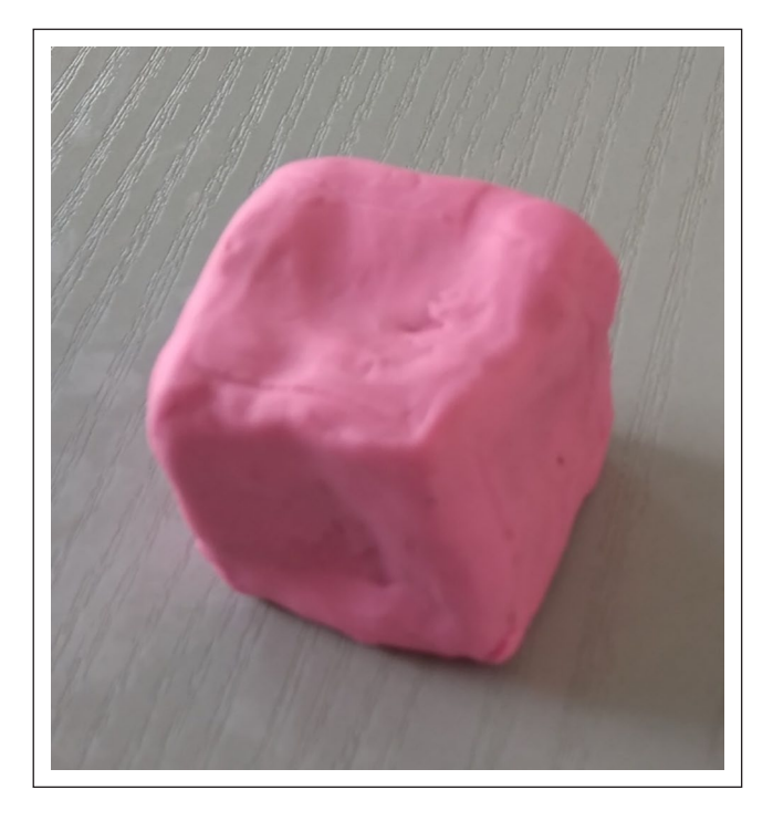
Figure 2. Plasticine model of a cube.

Students too discussed working alongside studying as highly problematic, and an infringement of the student experience. Sentiments like this were commonly expressed: 'I wish I could dedicate my time solely and exclusively to my degree and nothing else'. Although the Bologna reforms were not directly referenced, some students highlighted how the way that classes were organised – for instance, involving a lot of team projects (in many cases, an outcome of the Bologna reforms) – made it very difficult to work alongside studies. The manner in which the expectations of the university were divorced from the realities of many students' lives was also the focus of some of the plasticine models that students made to represent how they were viewed by others. For instance, one student made a model of a cube (see Figure 2 below) to illustrate that students had different sides or roles they had to play, including that of workers.