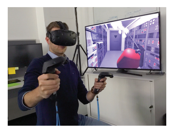
By ESA, image is for free distribution under Creative Commons Share Alike Licence (https://creativecommons.org/licenses/by-sa/3.0-igo)