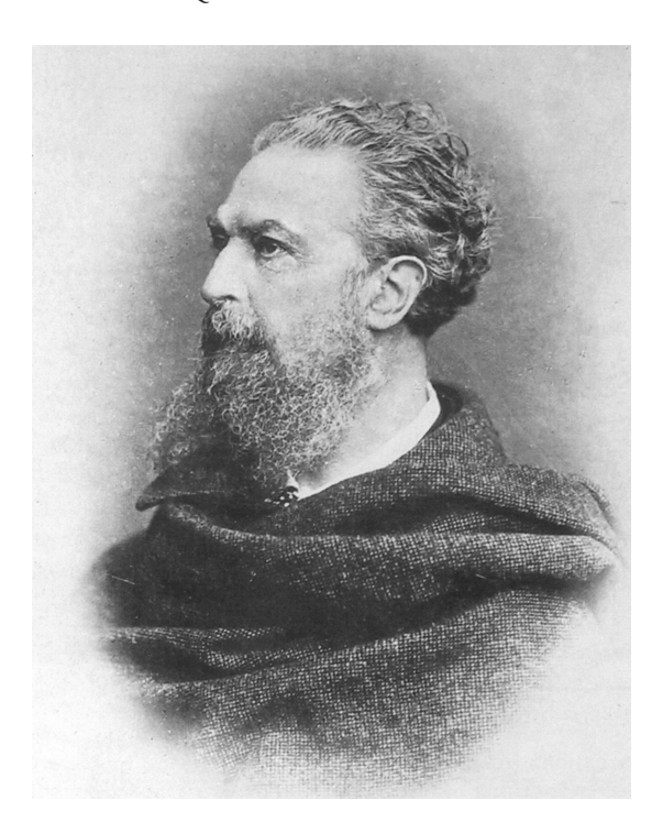
Fig. 2. Alessandro Castellani, photograph, from Catalogue des objets d'art antiques, du Moyen-Âge et de la Renaissance dépendant de la succession Alessandro Castellani (Paris, 1884).

was negotiated on behalf of the museum by Charles Thomas Newton, keeper of the Department of Greek and Roman Antiquities and a complex and highly influential figure in the history of collecting.<sup>11</sup>