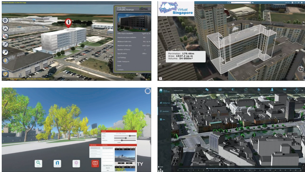
Figure 3. The four 3D spatial media shown to interviewees (top left, RealSim; top right, Virtual Singapore; bottom left, VU.City; bottom right, Building City Dashboards prototype).

insights, themes, or positions are being articulated, with there being a strong alignment of views across participants (Bowen, 2008). In our study, a strong overlap in opinions and experiences across our interviewees was quickly established. While our sample might be representative of views within the Irish planning system, there is a question as to whether they are shared elsewhere. There are reasons to believe that they will have resonance beyond Ireland as the themes and reasoning that