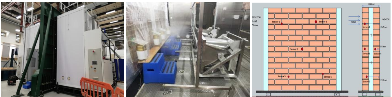
Figure 1: (from left to right) UCL CEGE integrated environmental-mechanical testing system at Here East; walls under WDR exposure; sensors locations

The WDR tests were carried out at the UCL CEGE integrated environmental-mechanical testing system composed of two climate chambers used to simulate indoor and outdoor conditions simultaneously (Fig 1). The rain system used for this study is composed of a built-in rain simulation system equipped with 18 x 60° nozzles arranged in the form of 3 rows within a portable frame, which is then positioned in front of horizontal fans to provide a wind speed equal to 3 m/s at the nozzles, such that an average of 450ml of water was dispersed on 3 gauges over 400cm 2 surface area over 5 minutes. Based on this, the amount of rain dispersed on each wall can be calculated as 2.25 L/m 2 /min, which compares well with the water application in ASTM E 514/C1601 (2014).