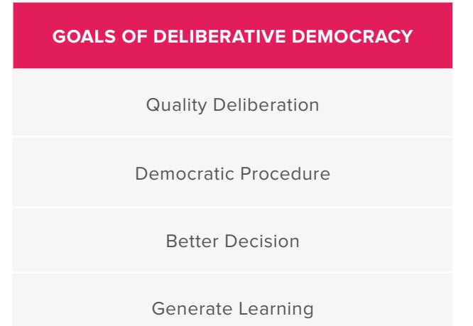
Figure 3. Goals of deliberative democracy.

The last goal of deliberative democracy is to generate learnings. Deliberative democracy is used as a mechanism for arriving at a decision and as a tool to educate participants to create a better understanding of the issue (Estlund, 1993). The goals of deliberative democracy are listed in Figure 3.