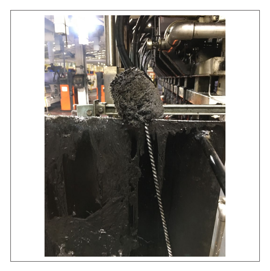
Figure I. A swabbing brush/stick used to apply oil (dobe) to the molds in the machinery that can be seen in the background of this photo.

being touched is essential in "bringing the ethnographer closer to sensory and semiotic action" (Barker, Jewitt, and Price 2020, 129). Participation took the form of attending training; laboring alongside workers and robots; taking breaks and having conversations with workers; talking about touch (and other sociosensorial matters) with laborers during activity.