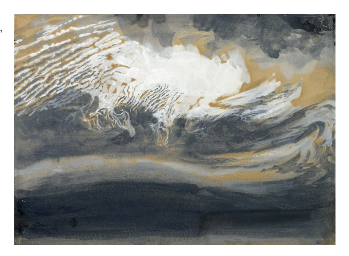
John Ruskin, Ice Old Man (c.1880). Watercolour, 12.5 × 17 cm. The Ruskin-Library, Museum and Research Centre University of Lancaster, Bailrigg