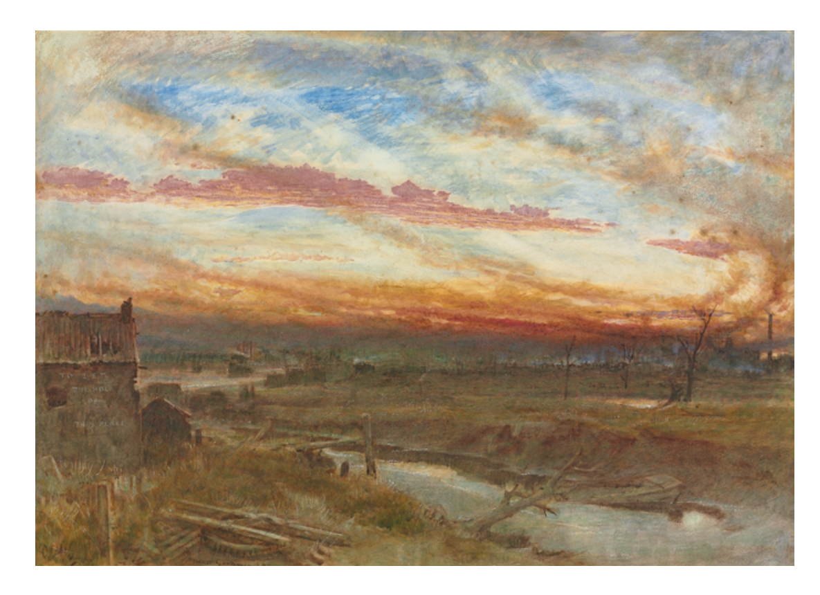
Fig. 9.4 Albert Goodwin, Sunset in the Manufacturing District (1883). Watercolour, 57.2 × 78.8 cm. Private collection.

shifting subject position—caught between temporal and geographic conditions—Ruskin's text strains at the borders of legible narrative order. 40 It is this continuously disturbed position that Storm-Cloud reflexively stages as the condition of the aesthetic subject in the time of environmental crisis. Rather than a subject opened toward the purposive unfolding of creation, Ruskin's text constructs a fearful, anxious 'animal frame' exposed to a frighteningly indefinite and mutable climate. It was this weakened perceptual capacity, bereft of a guiding environmental order, that he feared the storm-cloud would impose upon England and its artists.