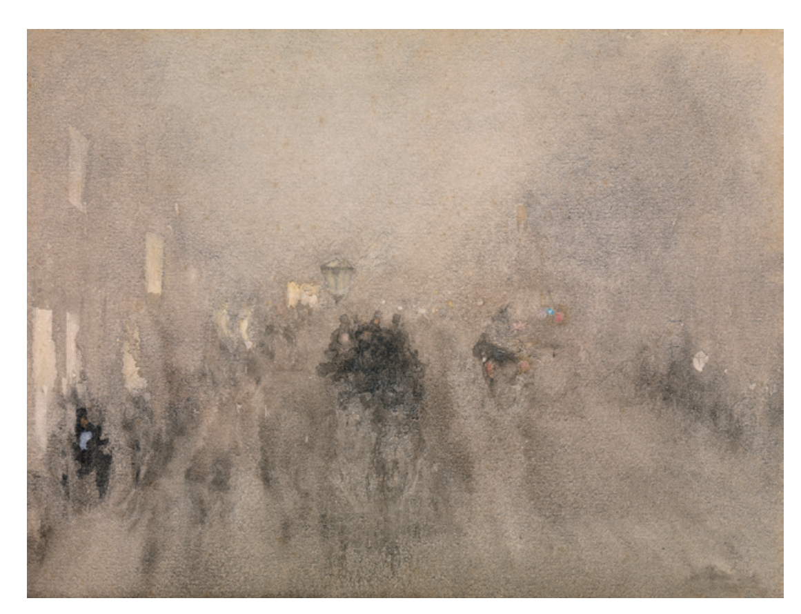
Fig. 9.6 James Abbott McNeill Whistler, Nocturne in Grey and Gold— Piccadilly (1881–3). Watercolour, 22.2 × 29.2 cm. National Gallery of Ireland, Dublin.

interpenetrating forms (Fig. 9.6). Here, though, this manner of painting is now applied to the clotted and obscured environment of London, in which buildings, figures, carriages have seemingly dissolved into the atmosphere around them. The 'trace of the means' that produces the dense coal smoke of Piccadilly is effaced alongside the labour of the artist. Such an environment appears, like the watercolour depicting it, to have spontaneously developed of its own agency, without attention to any other systems of 'consistence' that have been disrupted by the unseen forces of human labour and the coal combustion that produced London's obscured environment.<sup>71</sup>