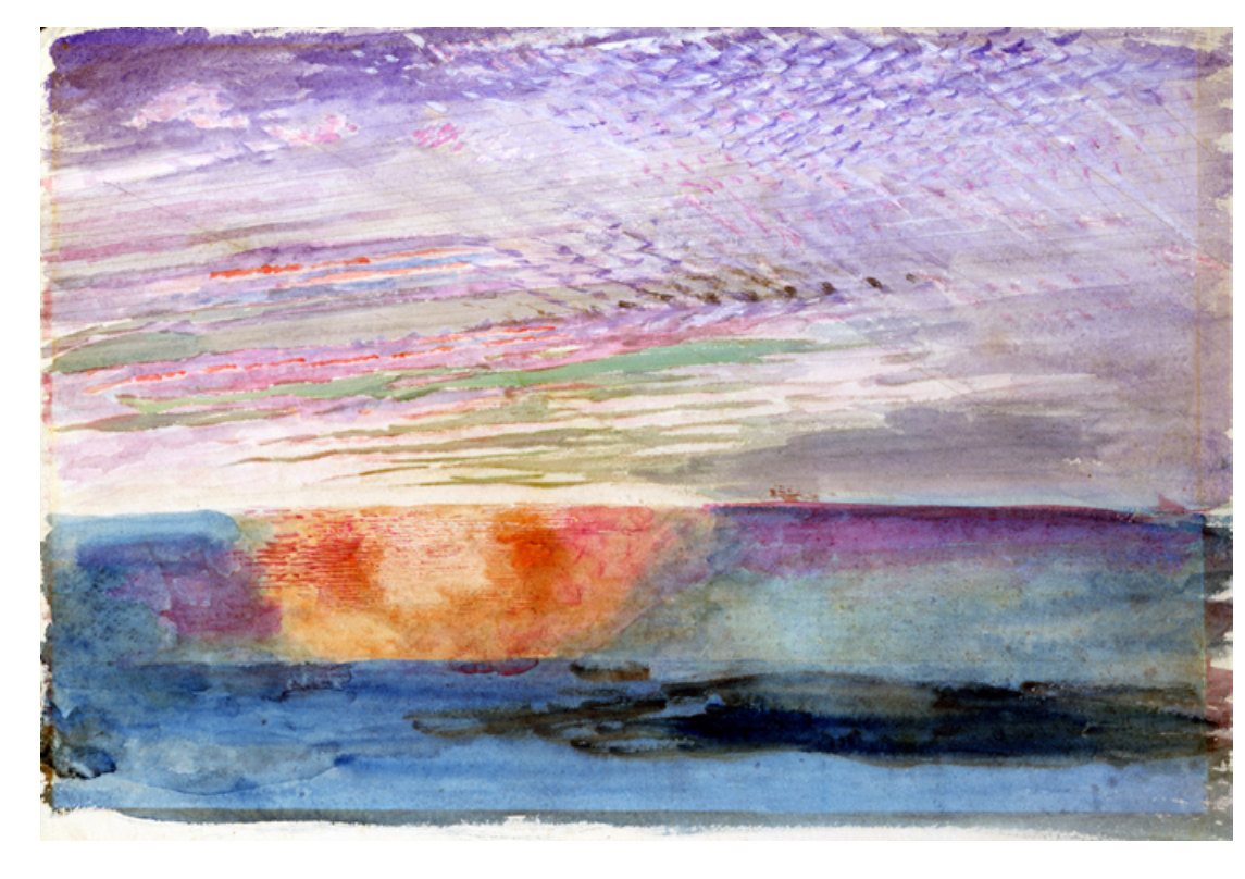
Fig. 9.3 John Ruskin, Sunset at Herne Hill (1876). Watercolour, 29.2 × 40.6 cm. Ruskin Museum, Coniston.

your own coal-scuttles'.<sup>29</sup> Such subjects—urban, interiorised, enclosed—were precisely the kind of artificially sustained 'animal frames' that he feared that the plague-wind would produce.