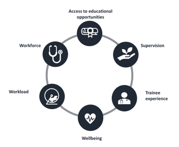
Figure 2: Impact of service change on doctors' training

Data analysis revealed six ways in which service change impacted on doctors' training: access to educational opportunities; supervision; the trainee experience; wellbeing; workforce; and workload (see Figure 2).