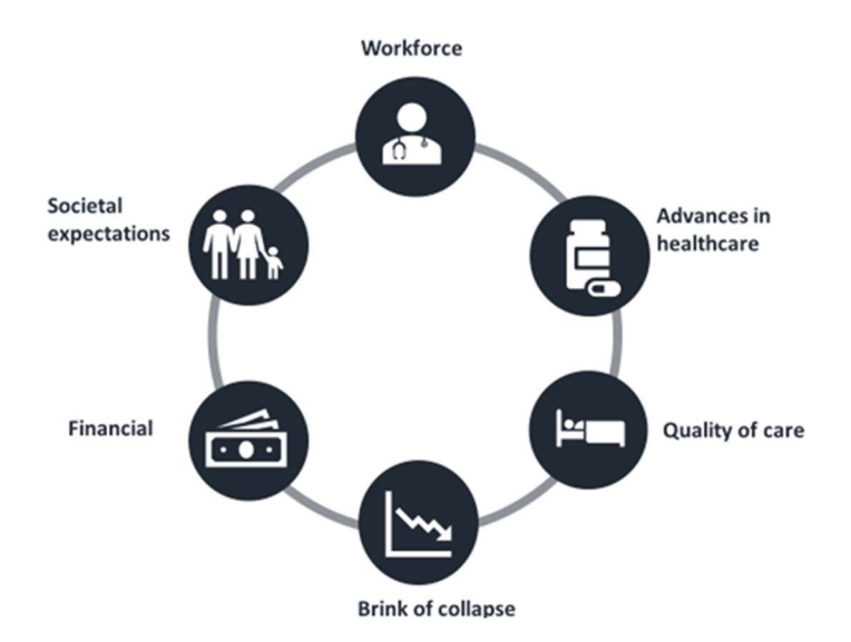
Figure 1: Drivers of service change

Figure 1 illustrates the six main drivers of service change and these were identified by the experts interviewed pre-pandemic. Whilst all were important in driving forward change workforce, finances, and variability in patient outcomes were regarded as the main reasons for reconfiguring.