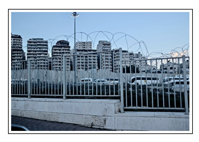
Figure 3. New development in Ras Khamis as seen from the western (Jerusalem) side of the Wall, October 2017.

In the limited literature concerned specifically with the areas of occupied East Jerusalem behind the Wall, these neighbourhoods are described in terms of their liminal and interstitial status – especially with