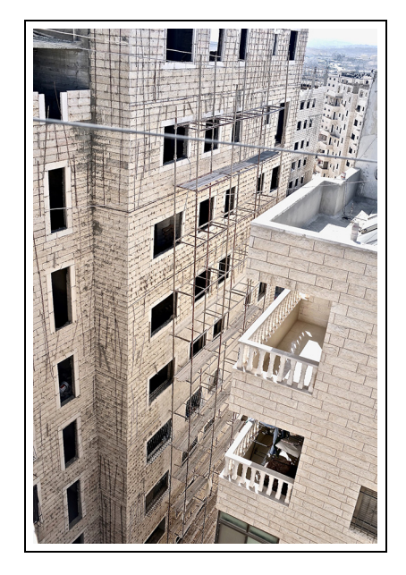
Figure 2. Kufr Aqab, October 2017.

representatives, the actual population of the camp is as high as 23,000 (interview, 4 September 2014). The wider area of approximately 1 km<sup>2</sup> includes smaller adjacent