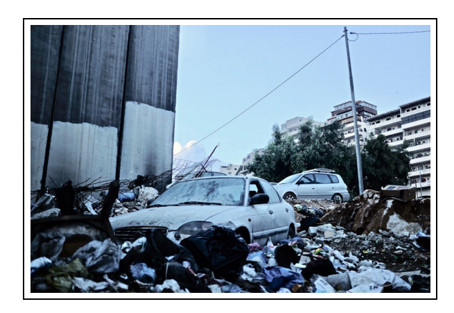
Figure 6. Wall, rubbish and new housing construction in Ras Khamis (Shuafat Refugee Camp area), October 2017.

Thus, the symbolic violence of waste as enacted here, in contrast to Bourdieu's sense of the term, does not involve the concealment or misrecognition of the power relations at its basis (cf. Bourdieu and Wacquant, 1992: 194-195). Yet, more in line with the Bourdieusian notion of symbolic violence, which entails the complicity of those subjected to it (Bourdieu and Wacquant, 1992: 167), Palestinians come to be imbricated in the Israeli-controlled city's wider power structures as they fight waste and assert their rights and belonging to the city. While Palestinians continue to boycott municipal elections in an expression of their non-recognition of Israel's rule over East Jerusalem (Dumper, 2014), the severe impact of infrastructural neglect and ubiquity of waste compels them to appeal to Israeli authorities, seeking to improve their circumstances with the help of the ethnocratic institutions they generally reject. If symbolic violence 'defies the ordinary alternative between freedom and constraint' (Bourdieu and Wacquant, 1992: 168 n122), it ties the oppressed into existing power relations in a more indirect and insidious way - adding nuance to existing discussions on agency