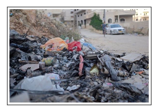
Figure 5. Burnt rubbish in Kufr Aqab, October 2017.

Beyond its physiological effects, the omnipresence of waste has psychological impacts. Not only did residents link the absence of