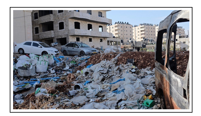
Figure 4. Dumping grounds in Kufr Aqab, November 2017.

Lack of planning, paired with the speed of densification, also affects networked public services. Water pipes are often not wide enough in diameter to supply the increased population, and the municipal water company does not send in engineers because of supposed security concerns (interview, contractor for HaGihon, 6 June 2014). Thus, even though most residents pay taxes for municipal services, the latter are increasingly inadequate (OCHA, 2013). In 2014, residents of Shuafat Refugee Camp were entirely without running water for weeks (Gerberg, 2014). Most Kufr Agab residents also suffer from insufficient and irregular water supply. Thus, Nidal and Amneh, who had running water between three and five days per week, habitually rationed how much water they used for showers and laundry. Mariam coped with the uncertainty of water supply by maintaining a gym membership in Ramallah for the sole purposes of ensuring she would be able to shower on a daily basis (interview, 4 August 2015). The absence of a proper sewage network can have devastating effects. According to the local committee, 40 houses were permanently damaged in Kufr Agab when they flooded because sewage water could not