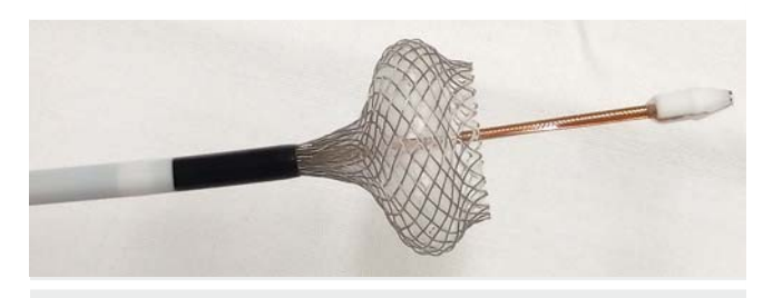
Fig. 2 Partially deployed LAMS.

Two sizes of stent -10 \text{ mm} \times 10 \text{ mm} and 15 \text{ mm} \times 10 \text{ mm} were used in this study. Stent size was chosen by the endosonographer at the time of the procedure. No lavage and debridement was performed at the index procedure.