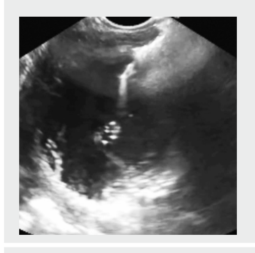
Video 1 Cyst gastrostomy with LAMS.