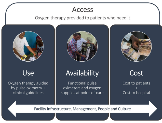
Figure 3 Three domains of data on the quality of 'oxygen access'.

This study was conducted to inform the 'Integrated Sustainable childhood Pneumonia and Infectious disease Reduction in Nigeria' (INSPIRING) programme, implemented by Save the Children to improve child health in Jigawa and Lagos states. INSPIRING involved civil society representatives in co-design activities, including a co-design workshop in April 2019 involving representatives from civil society, local and national government