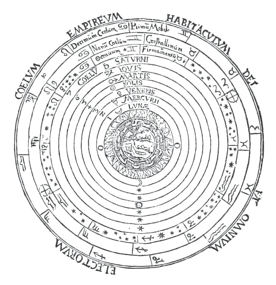
Figure 2.2 Cosmographia, Peter Apian 1539.

demonstrated, is epistemologically and ethically fraught, the reader was theoretically made virtually present (co-present) through the rhetorical tropes employed by the ethnographer. The reader is co-present in the register of a textual ekphrasis, and, even though not co-local, is able to experience a given society (The 'full flavor of native life' Malinowski 1988: 48).