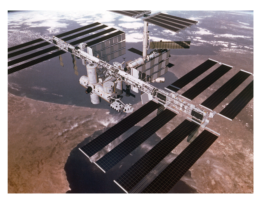
Figure 2.3 Artist's rendering of ISS above earth, passing over the Straits of Gibraltar. NASA ID 9802668.

being; to use Heideggerian language – they serve to 'gather' seemingly incommensurate realms within an expanded field of 'worlding.'