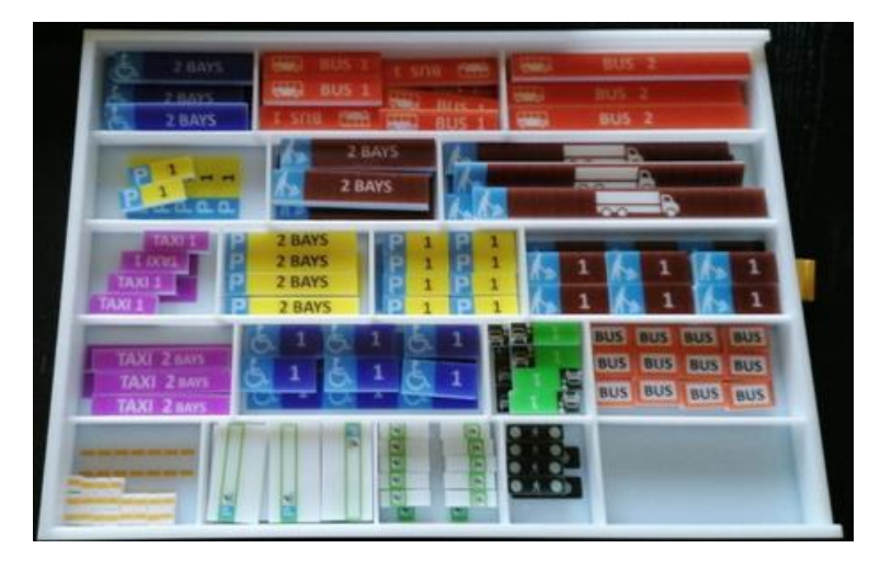
Figure 5: Road design toolkit.

Participants in workshops are provided with a toolkit of blocks and acetates representing design elements (e.g. bus stop, parking/loading bay, trees, bus lane, cycle lane, etc.), all at the same scale (Figure 5). Participants then experiment (negotiating with each other) with different arrangements that fit into the available road width (Figure 6). The toolkit facilitates the co-creation exercise, by illustrating the types of elements that can be included in the design and ensuring that the designs are feasible, as each element is drawn to scale.