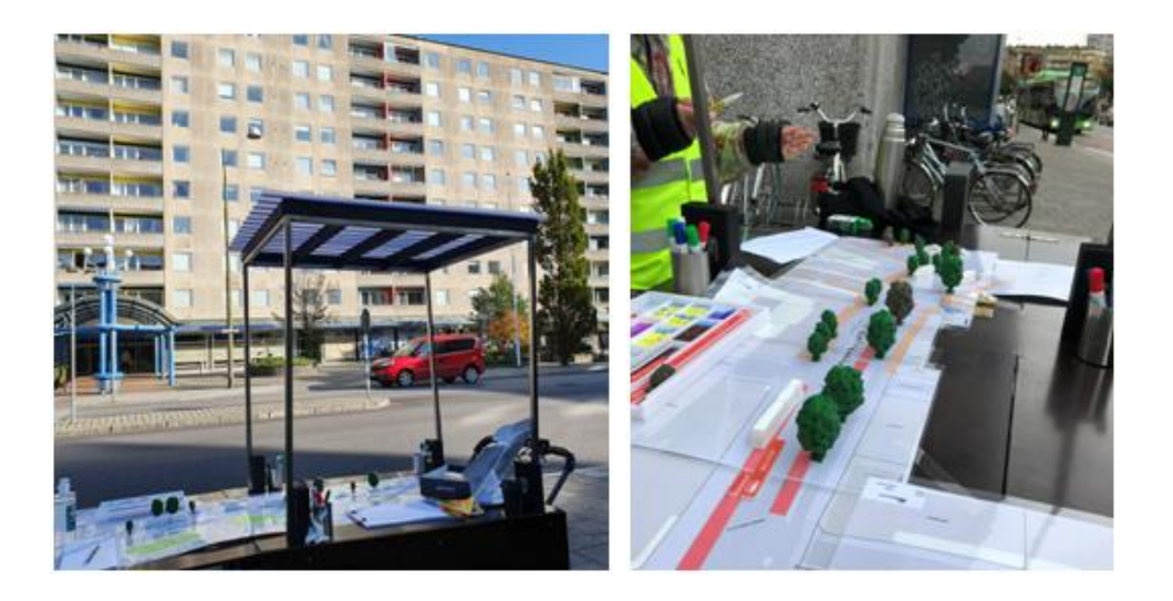
Figure 6: Road design toolkit in use in Malmö.

The created designs are then digitised into LineMap, a design software developed by Buchanan Computing, a project partner. The designs can be represented either as road markings or as blocks replicating the design toolkit (Figure 7Figure 8). The designs can then be refined by professionals and then be exported to other software (e.g. GIS, microsimulation)