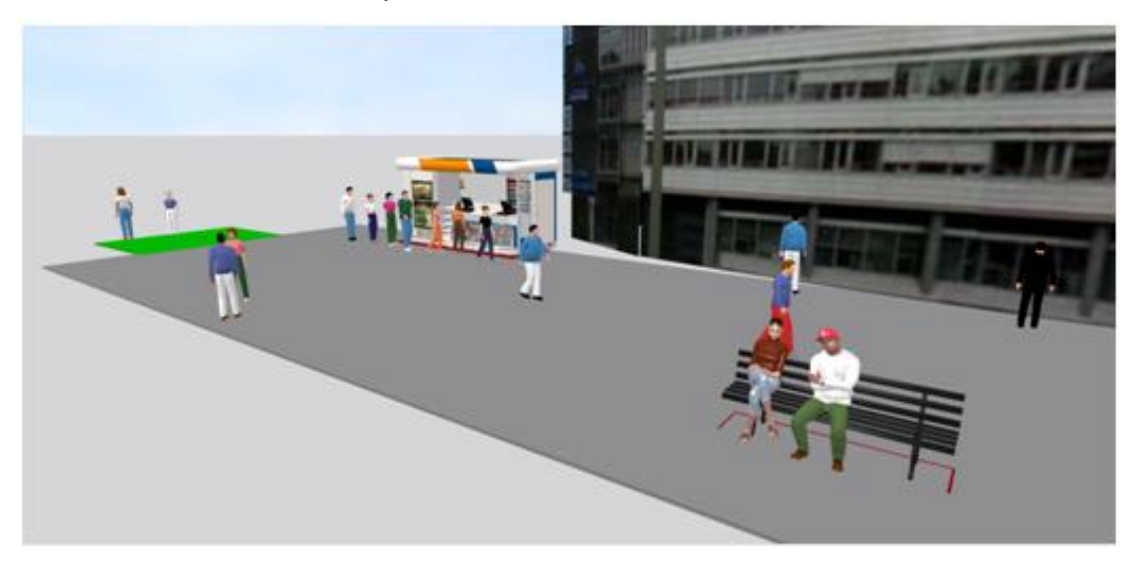
Figure 8: Microsimulation of place activities (Extract from PTV Vissim model).

The simulation produces indicators of the effects of road design options on all road uses. Previously, most of the indicators produced by microsimulation software were relative to the movement of motorised vehicles (e.g. vehicle density, travel time, average speeds, delays, stops). The new functionalities allow for the calculation of new indicators, including the average number of stops per pedestrians, average number of pedestrians waiting for public transport, share of time a parking space is occupied by stopped vehicles, total number of stopped vehicles, total value of parking fees, and number of vehicles that could not be parked.