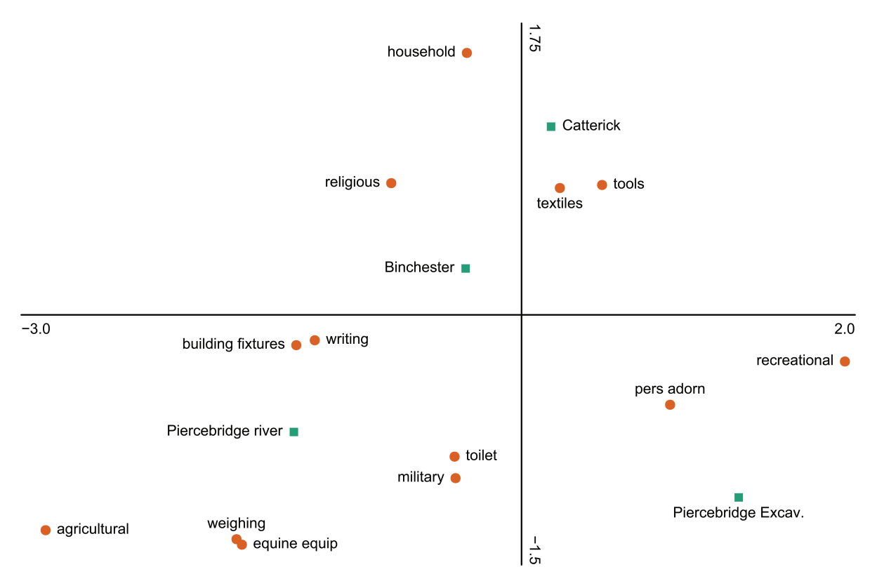
FIG. 22.5. Correspondence Analysis with obvious outliers removed. First (horizontal) and second (vertical) axes of inertia; sites in green, finds categories in red

The PAS dataset, which forms just over 30 per cent of the total, will have an influence on the results. As the PAS dataset is less controlled than the other four assemblages, it is worth removing it. A comparison was made between a CA of the remaining four assemblages with all the finds categories, and a CA omitting agricultural and recreational items. As before, there is very little difference as measured by the PSI, so we will examine the version with all the finds categories.