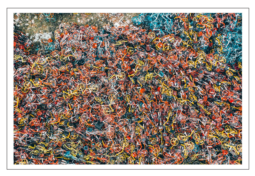
Figure 4. A pile of shared bikes in Shanghai.

Second, public experiments today almost inevitably raise questions about responsible governance. Attempts at 'disruptive' or 'transformative' innovation increasingly work within, or even purposefully create, zones of legal ambiguity and exception that may become institutionalized and permanent. Uber, Facebook, Google, and others continue to insist that existing laws, regulations, and norms on such issues as employment, privacy or freedom of speech do not apply to them because their innovative products and services operate in unprecedented legal territory. Living labs often purposefully lower regulatory burdens to experience the effects of novel technologies in real life 'as if' these technologies had already been proven safe and effective (Engels et al., 2019; Laurent, 2016; Laurent et al., 2021). Experiments in development economics enroll people in largescale experiments with unclear answers to questions of consent, risk or benefit sharing. In all cases, innovators and policymakers tend to see existing regulations and norms as a hinderance to scaling. Scalability thinking thus fits in a highly problematic framing that sees innovation as the 'driver' of change and regulation 'lagging' behind (Hurlbut et al., 2020; Jasanoff, 2011; Pfotenhauer and Juhl, 2017). A critical analysis of the politics of scaling must broaden the space of reflection about how innovation and regulation can relate to each other beyond such one-dimensional framings.