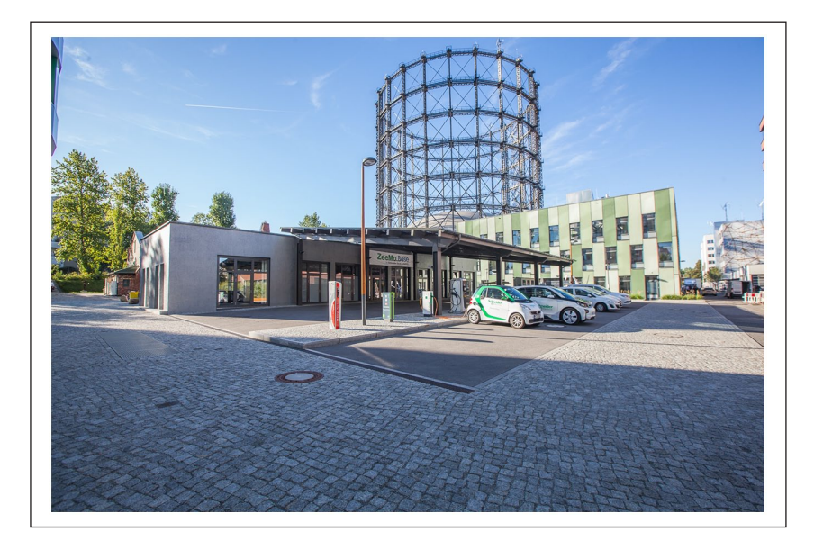
Figure 3. View of the European Energy Forum (EUREF) campus in Berlin, a 'living lab' for energy transitions and new digital and mobility technologies aimed at broader urban (and global) transformations. Technology tests include, for example, the parameters of different charging stations for electric mobility, seen in the center of the image.

tests in China and Germany), digital finance (e.g. Singapore's FinTech sandbox), sustainability transitions (e.g. Masdar City in Abu Dhabi) or a mixture thereof.