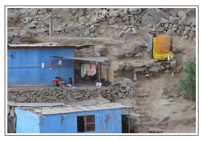
Figure 3. Everyday life in the upslope expansion in JCM.

Crucial to overcoming stigma were the possibilities that emerged as Francisco became involved in Lima's peripheral urbanisation processes. During the first years, together with other families, he bought water from settlers further down the slope, who benefited from a tank installed in 1995 by SEDAPAL, the public water and sanitation utility. Lacking sanitation, most households relied then on open defecation in 'silos', shallow holes surrounded by plastic sheets that provide some privacy. Today, 80% of the 110 families living in Quebradas Verdes continue this practice due to the lack of sanitary facilities.