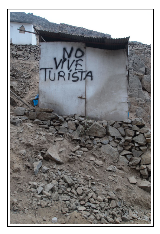
Figure 5. The 'tourist'. The sign states 'Doesn't live here – Tourist', showing the way in which community leaders mark the shacks of those presumed to settle a structure for speculative purposes, rather than with the aim of dwelling.

hometown in the Province of Ayacucho, leaving all she had in search of a better life: