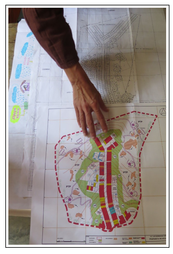
Figure 4. Carving the slopes in JCM: Certified plan and projected extension.

gradual improvements in the settlements (Allen, 2014).