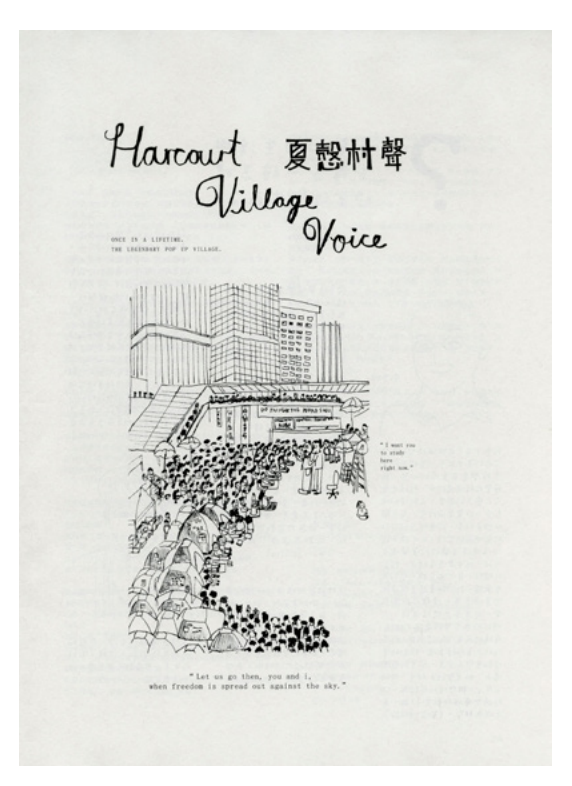
Figure 1: Harcourt Village Voice.

Five years after the Umbrella Movement, in 2019, Hong Kong experienced its largest political storm in post-colonial history as the HKSAR government pushed forward a controversial extradition bill which would allow the extradition of Hong Kong citizens to Mainland China. People were anxious that the Chinese government would utilize the bill to arrest political dissidents in Hong Kong. A million people marched