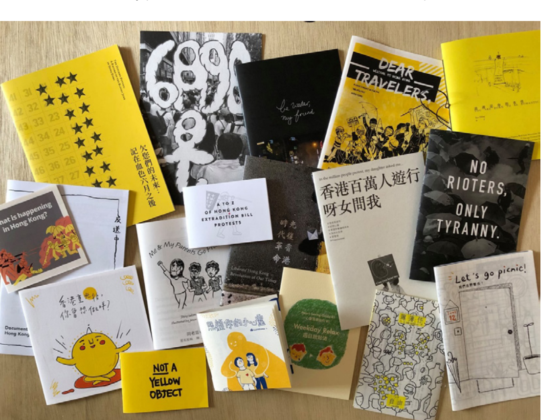
Figure 2: Examples of the protest zines in Anti-Extradition Bill Movement.

The term "zine" was coined in the 1930s and was subsequently popularized by punk fans in the 1980s (Radway, 2011). There is a substantial body of scholarship on zine production in the 20th century, and in particular, feminist zines. Many scholars theorize zines