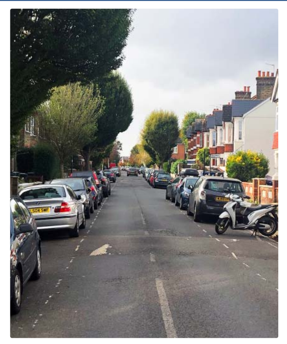
Ealing LTN21 has been removed - and traffic has returned to the residential neighbourhood

A well intentioned project, aimed at reducing traffic levels in suburban Outer London, had been poorly implemented and was perceived to have gone badly wrong. But this type of neighbourhood is exactly where traffic levels are too high and travel behaviours are environmentally unsustainable. As Lefebvre suggests,<sup>2</sup> decades of capitalism have affected our perception and use of space. We have given our streets over to the car, and pedestrians and cyclists have lost the opportunity to use the street. The motor manufacturers and associated organisations have persuaded us that we need to travel around in their product, and we have shaped the built environment accordingly. Many residents have become used to this way of life, and the car is embedded in and facilitates it.