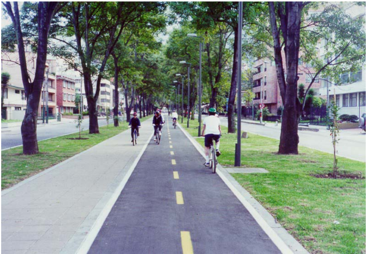
Fig. 5. Bogota's extensive network of cycle ways has helped to position the city to become car-free by the year 2015.

Bogota's initial 41 km of exclusive bus lanes on three different routes is only the beginning. The municipality's vision for the busway system, known as Transmilenio , is to one day cover the entirety of Bogota's vast urban area, and place 85% of the population within 500 meters of a busway station. Bogota's buses will also be amongst the lowest-emitting in the region, due to strict emission standards for the private firms wishing to bid as bus service providers. These standards are expected to reduce emissions by 80% compared to the existing private fleets utilized in the city today (Rodriguez, 2000).