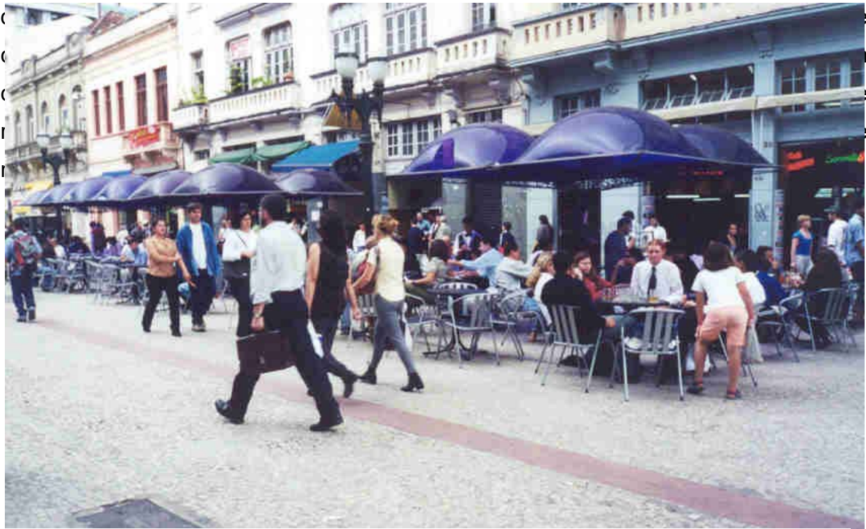
Fig. 6. Quality of life: Curitiba's car-free pedestrian zone is a natural complement to the city's extensive busway system.

A close relationship actually exists between the development of an efficient public transport system and the effectiveness of non-motorized options such as pedestrian zones and cycle ways (see Figure 6). High public transport use reduces the