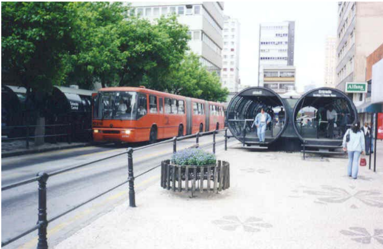
Fig. 3. With its efficient station design and high-capacity buses, Curitiba has revolutionized the way in which municipalities around the world view public transport.

surface emerged. The municipality developed its first express bus lanes in 1974 and has continued to expand the system to this day. The later introduction of boarding tubes that emulate the comfort and security of subway stations as well as the procurement of 270 passenger bi-articulated buses earn the system the nametag of "surface subway" (see Figure 3).