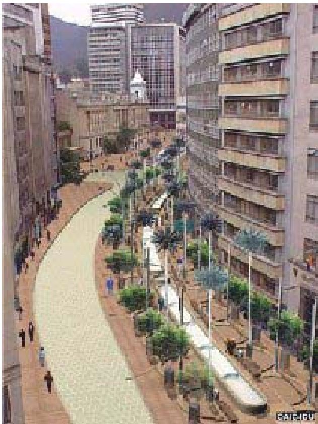
Fig. 4. Bogota's vision for a sustainable transport future. Illustration courtesy of the municipality of Bogota, Institute for Urban Development.

While both Curitiba and Quito are moderately-sized cities at approximately two million inhabitants each, the next test for the busway concept is being attempted in the larger metropolis of Bogota, Colombia. With a population of nearly 7 million dispersed across a wide, high-altitude valley, Bogota is a certain transport planning challenge. Colombia is in the midst of a great national upheaval, as government forces, guerrillas, and paramilitaries are involved in daily skirmishes that threaten the country's stability and future. Over 2000 citizens are taken hostage each year as part of this conflict. In addition, the nation is facing serious economic difficulties with unemployment now over 20%.