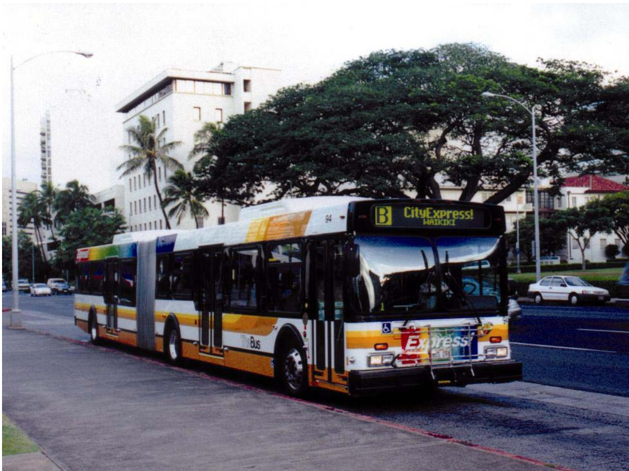
Fig. 10. Honolulu has utilized Latin American busway designs to develop its highly-popular CityExpress! system.

Most of the busway systems planned in the US are currently in the developmental and pilot testing stage. Such works-in-progress include proposed busway systems in Los Angeles, Santa Clara, Hartford, Eugene, Cleveland, Boston, Louisville, and Oakland. A US system that is partially completed and has already proven its worth can be found in Honolulu. Despite the city's island paradise persona, Honolulu has long suffered air quality and traffic congestion problems. In its short period of operation, the Honolulu CityExpress! system has helped alleviate these problems and has won high public acceptance (see Figure 10). The system follows a 20-km coastal path along the length of the city, and has now been expanded to include a new CountryExpress! extension