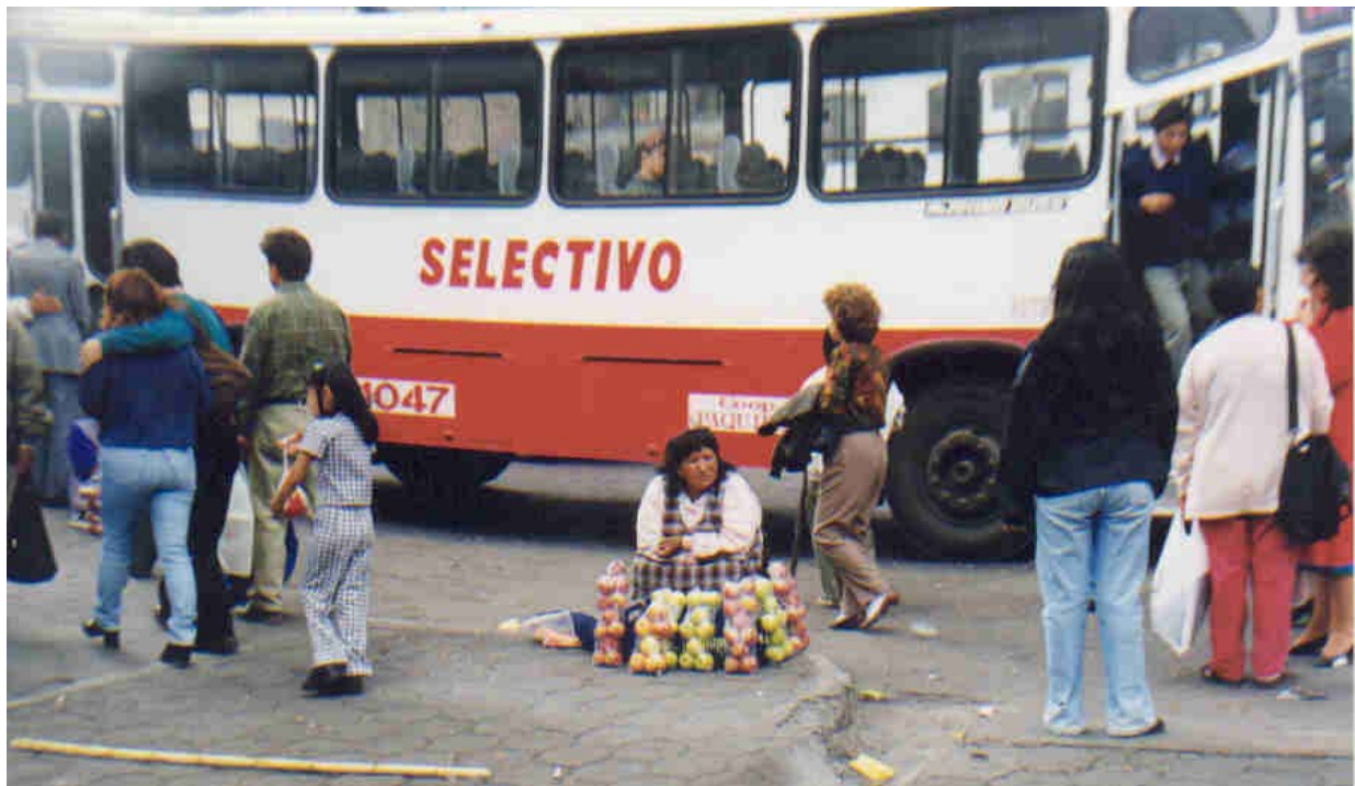
Fig. 2. Children and the poor work long hours in the streets of Latin America, only a breadth away from highly polluting tailpipes.

Perhaps most affected by Latin America's spiraling car-ownership levels are the segments of society with the fewest options to protect themselves against the growing tide of pollution. Informal workers ply their trades and goods along Latin America's busiest streets in order to remain a small step ahead of absolute poverty (see Figure 2). Many work 12-16 hour days only a breath away from tailpipes emitting particulates, carbon monoxide, and nitrogen oxides at levels well beyond the maximum recommended by the WHO.