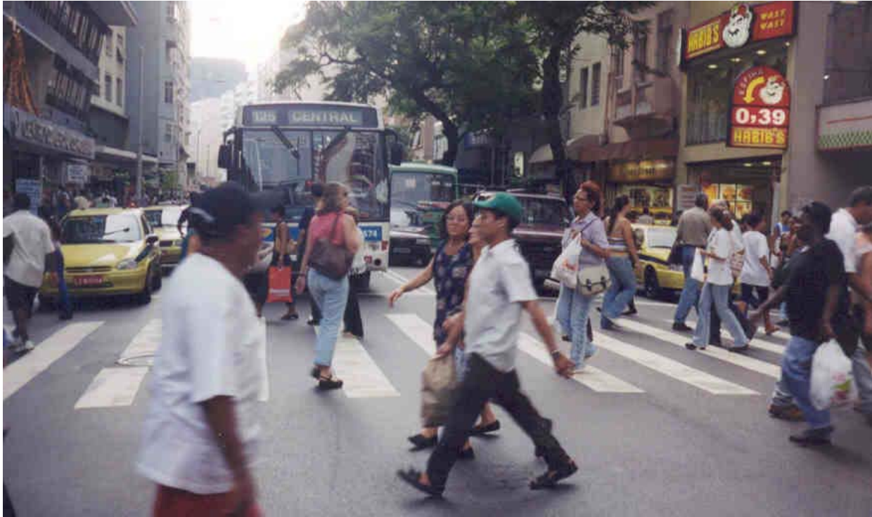
Fig. 1. The rapid growth in automobile ownership in Latin America has stretched the capacity of urban road infrastructure to its limits.

Latin American countries now exceeding $3000 per capita, automobile purchases are taking off at an accelerated pace. From 1970 to 1990, the Latin American vehicle fleet grew by about 250%, reaching 37 million vehicles (World Bank, 1997). Unfortunately, much of this growth consists of older, used vehicles imported from nations where their useful lives are long past. Emissions from such older vehicles are several times greater than those of newer models due to outdated technologies, neglect, and improper maintenance.