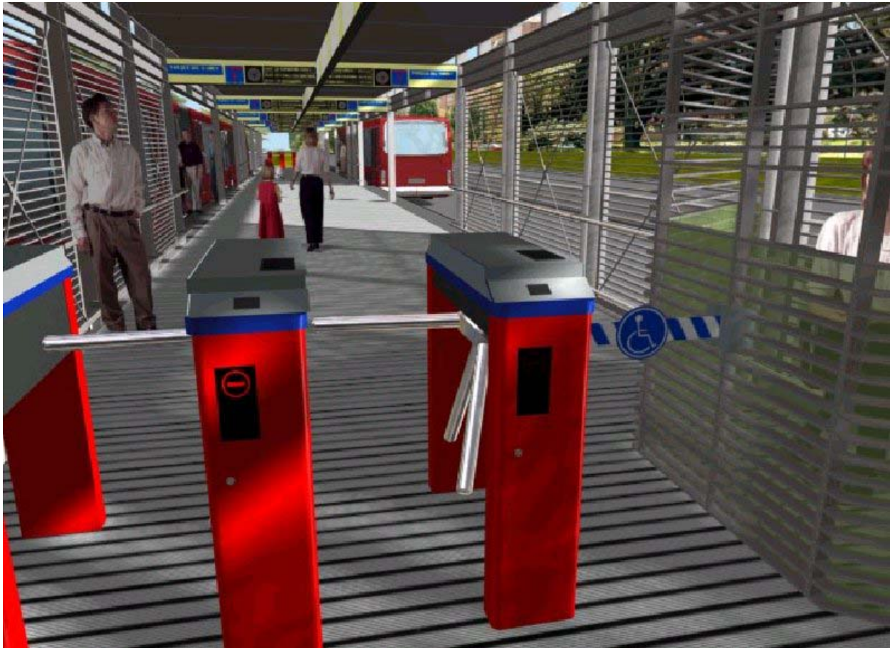
Fig. 8. Bogota's vision for secure and pleasant loading stations helps build customer confidence in the Transmilenio system.

rash of car abductions now plaguing much of Latin America, busway use has suddenly become the safest option. The seating and public telephones provided in the stations are also additional examples of client-focused design that helps the customer make use of waiting periods. In Quito, video screens in the stations provide public transport users with news and entertainment.