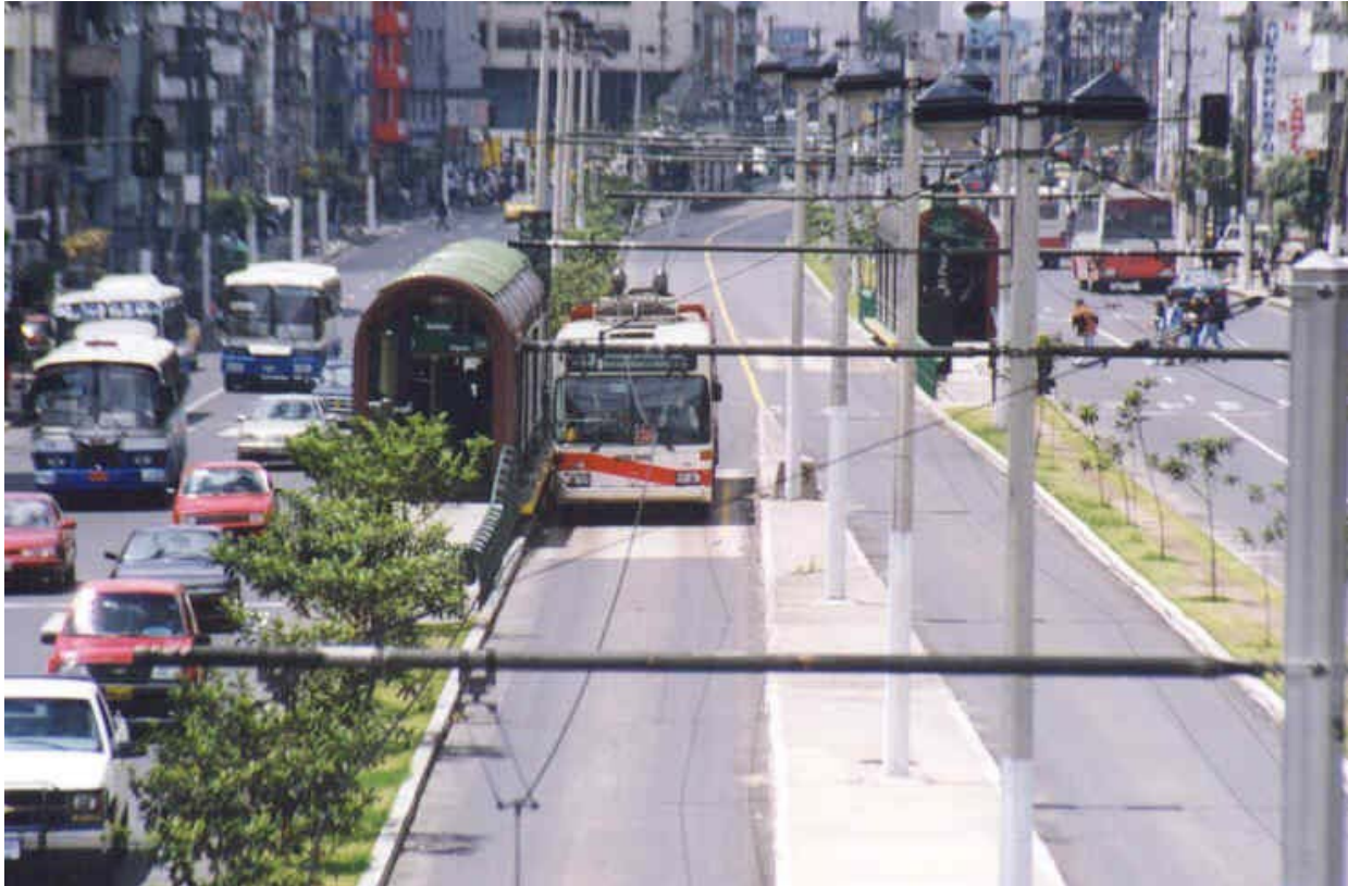
Fig. 7. The rapidity of exclusive bus lanes makes busways the most time-efficient option for commuters.

more luxurious underground systems. Exclusive bus lanes, rapid boarding and alighting, secure and comfortable stations, colour-coded routes, widely displayed system maps, simplified ticketing, and sophisticated marketing identities have all transformed the way transport and planning professionals view today's municipal bus systems. While these design and service features have helped to make dramatic improvements in system effectiveness and customer satisfaction, each is relatively low-cost to implement and relatively low-tech in nature. Thus, another lesson from the Latin American busways is that simple, ingenious, low-technology solutions are often of much greater value than more complex and costly alternatives.