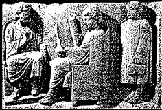
Cover photograph: school scene from a funerary pillar, c.180 B.C., from Gallia Belgica.