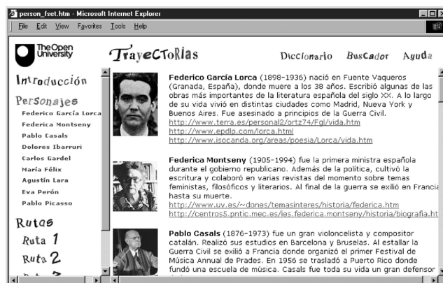
Fig. 3. Presenting real and complex settings.