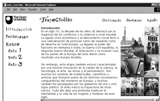
Fig. 2. Orientation on meaning: Task's introduction to the historical context.

and link the information to find the points of contact between the different characters, and use summary skills. Moreover, the task does not have a right or wrong answer, rather, it prompts different outcomes from different students.