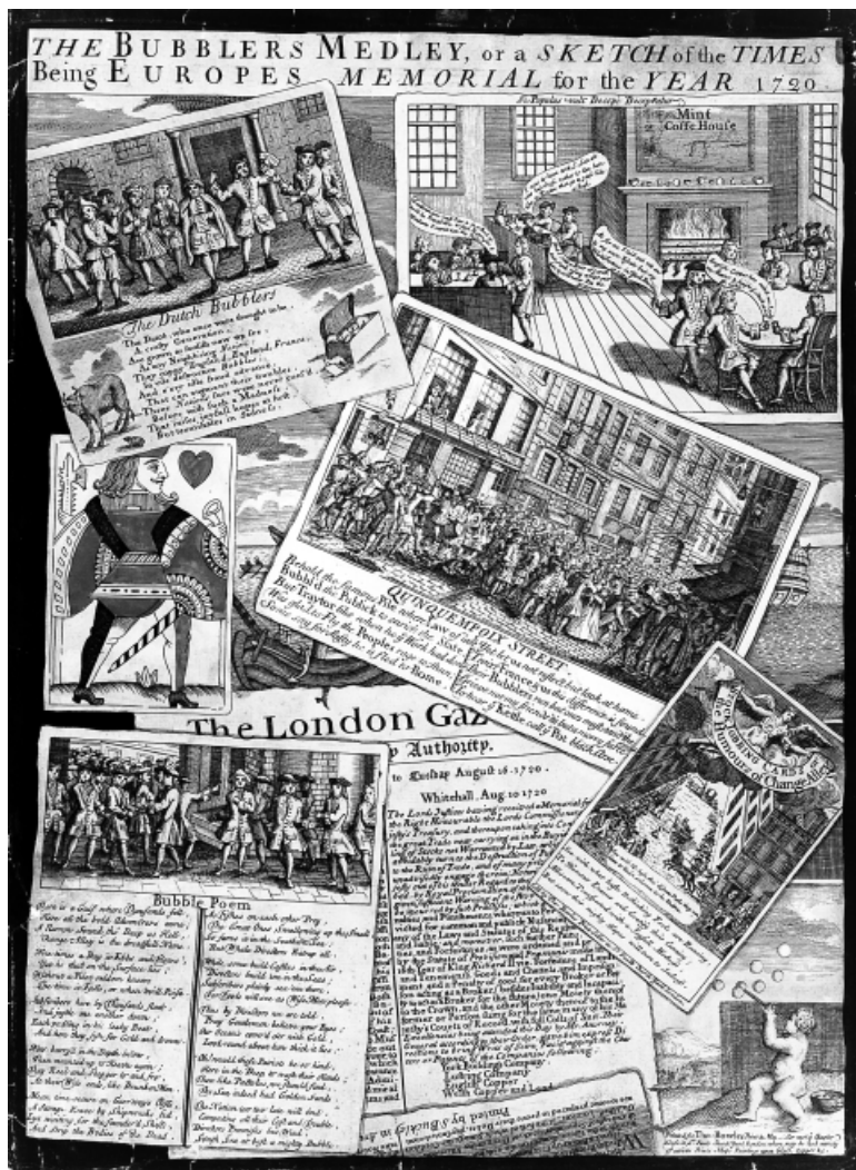
Plate 2 Anon., 'The Bubbles Medley', 1720.

great source of our misfortunes; it is but the natural effect of those principles which for many years have been propagated with great industry. 58 In this analysis, which was made by others, the South Sea