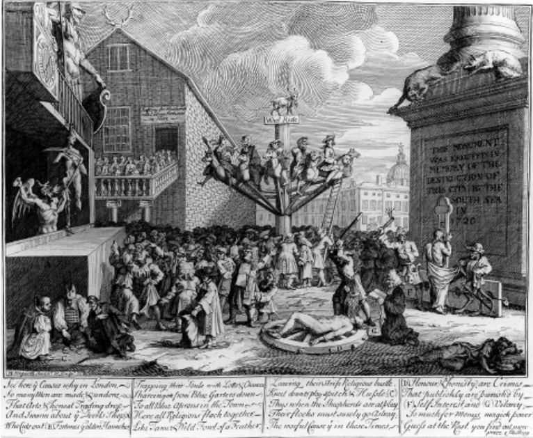
Plate 1 W. Hogarth, untitled allegory on the South Sea Bubble, 1721.

largely out-of-bounds. In fact, trade was always of minor importance to the company, for it had been established to help the Tory government organise the national debt and exploit public credit after nearly twenty years of expensive warfare. Its political origins, as a counterweight to the Whiggish Bank of England and East India Company, were fundamental. As such it was a vital part of the ‘financial revolution’ that took place in the generation after the Glorious Revolution of 1688–9. 3 That revolution centred upon how the government established a permanent and funded national debt by employing parliamentary promises of future tax revenues to repay what had been borrowed. But initially there was much about this that was uncertain and experimental. Some of those problems were mainly administrative and organisational, but some were political, not least because of the potential threat to creditors of a Jacobite restoration. Consequently, very high interest rates often had to be offered in order to attract lenders. After the successful peace of 1713, which reconfirmed the Revolution settlement