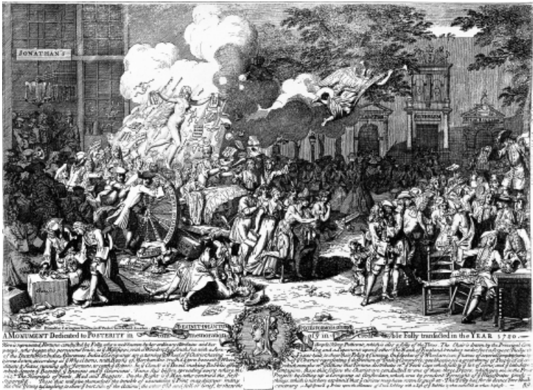
Plate 3 B. Picart, 'A Monument Dedicated to Posterity in Commemoration of Ye Incredible Folly Transacted in the Year 1720', 1720.

Bubble could be viewed as a symptom of wider problems, where luxury had infected society and atheism was rampant. One sign of that was the alarming rise of highway robberies about London and of masquerades and a debauched stage within – it is ironic that Steele's attacks on the South Sea scheme were in his periodical The Theatre that defended the stage from moralisers. 59 It is worth recalling that in March 1721 there was a Privy Council proclamation against the so-called Hell Fire clubs, that in April a bill against blasphemy was introduced into the Lords, though it was not enacted, and that at much the same time a campaign was underway by justices in Westminster to suppress gaming houses. 60 Thus, it might appear providential that the plague broke out in southern France in the autumn of 1720, prompting quarantine measures to keep it and God's wrath at bay. There were, therefore, a range of issues of concern to the socially and religiously nervous in 1720 and 1721 and the Bubble needs to be put in that wider moral-reform context. Contemporary reactions to the Bubble were