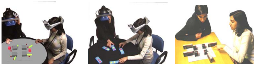
Figure 5 Interactions in AR (left).