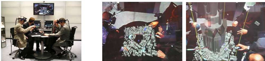
Figure 4 Multi user interactions and play with the church scale - CeBit 2004

All in all, the CeBIT test runs were highly successful. They provided not only valuable feedback on shortcomings, more importantly they verified the approach and the direction taken in developing ARTHUR. Most users quickly got into using the system and were then happy and willing to play with it and - on several occasions – test its limits (many users managed to scale the example church to several times its original size and seemed to enjoy the resulting dwarfing of the cityscape) (Figure 4).