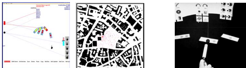
Figure 3 Linking the agent software in GRAIL (left). Interaction with CAD menus in ARTHUR (right)

5. The ARTHUR system has integrated a major CAD system (MicroStation) enabling architects and engineers to directly create and manipulate a virtual (CAD) model during design and review sessions. The virtual model is displayed on top of the Augmented Round Table using the head mounted displays. By using a 3D pointer or finger gestures, the users are able to draw directly in the (augmented) real world, without having to use a separate CAD workstation. Virtual menus floating above the Augmented Round Table allow CAD tools to be selected, e.g. drawing b-spline curves, spheres and tori, as well as extruding surfaces and changing colors. After selecting a tool users are able to draw the appropriate objects in 3D space. Additionally, the users are able to move and delete objects. The virtual menus are bound to placeholder objects (Figure 3 right) and therefore can be moved around on the table to get them into the view or move them out of the view to enlarge the working space. The system architecture will allow all tools and functionality of the CAD software to be integrated into the ARTHUR system, e.g. solid modelling, constraint solving, etc. As such, 'full fidelity' CAD models are created and interactively displayed by the system; there are no translation or conversion issues and the CAD models can be used directly in downstream design processes (Broll et al, 2004).