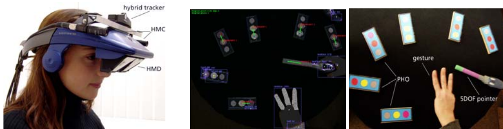
Figure 2 ARTHUR See-through HMD and CV-based recognition of PHOs, pointers, and finger gestures.

3. An AR framework supports the connection and communication of all these devices and links them to the actual architectural design, urban planning and simulation applications by an application interface. The framework supports multiple users, ensuring that all participating users see identical virtual objects on the table.