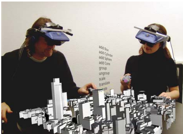
Figure 1 Collaboration within the ARTHUR environment

We present our approach ARTHUR, which integrates form creation with the simulation of functional performance, such as the simulation of pedestrian movement, as an important component of the collaborative design table. ARTHUR uses optical augmentation and wireless computer-vision (CV) based trackers to support collaboration within the 3D environment (Figure 1). Computer Vision techniques take input from stereo Head-Mounted Cameras (HMCs) and a fixed camera, to track the movements of placeholders on the table and the user's hand gestures. Virtual objects are displayed using stereoscopic visualization to seamlessly integrate them into the physical environment. Moreover, and unlike most AR systems, complex geometry can be directly created within ARTHUR using the integrated CAD system (MicroStation), which supports more advanced functionality such as 3D sketching and complex solid modelling.