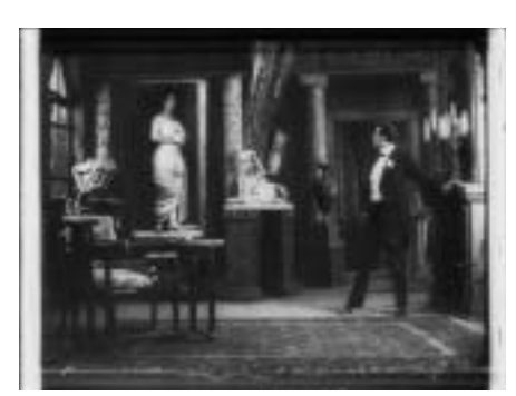
Figure 5: Taina doma no. 5 : jilted courtesan El'za appears to her ex-lover in the guise of a portrait painting