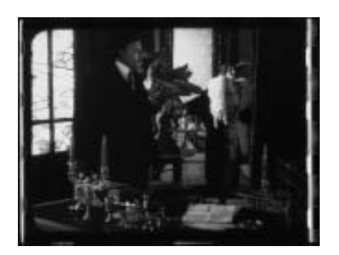
Figure 10: Ty pomnish' li? : Karalli enters her husband's study