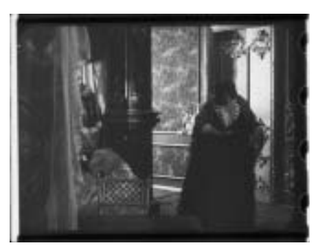
Figure 15: Iurii Nagornyi : Emma Bauer moves towards the table