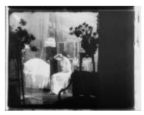
FIGURE 1: Sumerki zhenskoi dushi: Vera sits alone in her boudoir