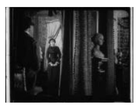
Figure 4: Kreitserova sonata: decentred arrangement after the leftward panning shot