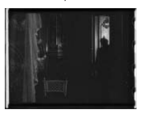
FIGURE 14: Iurii Nagomyi : lighting mise-en-abîme — Emma Bauer enters the room