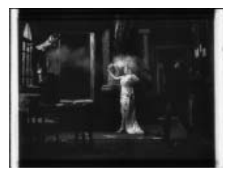
Figure 6: Taina doma no. 5 : the exlover is shot by El'za's accomplice as he seeks to escape

All frame stills reprinted courtesy of Gosfil'mofond Rossii.