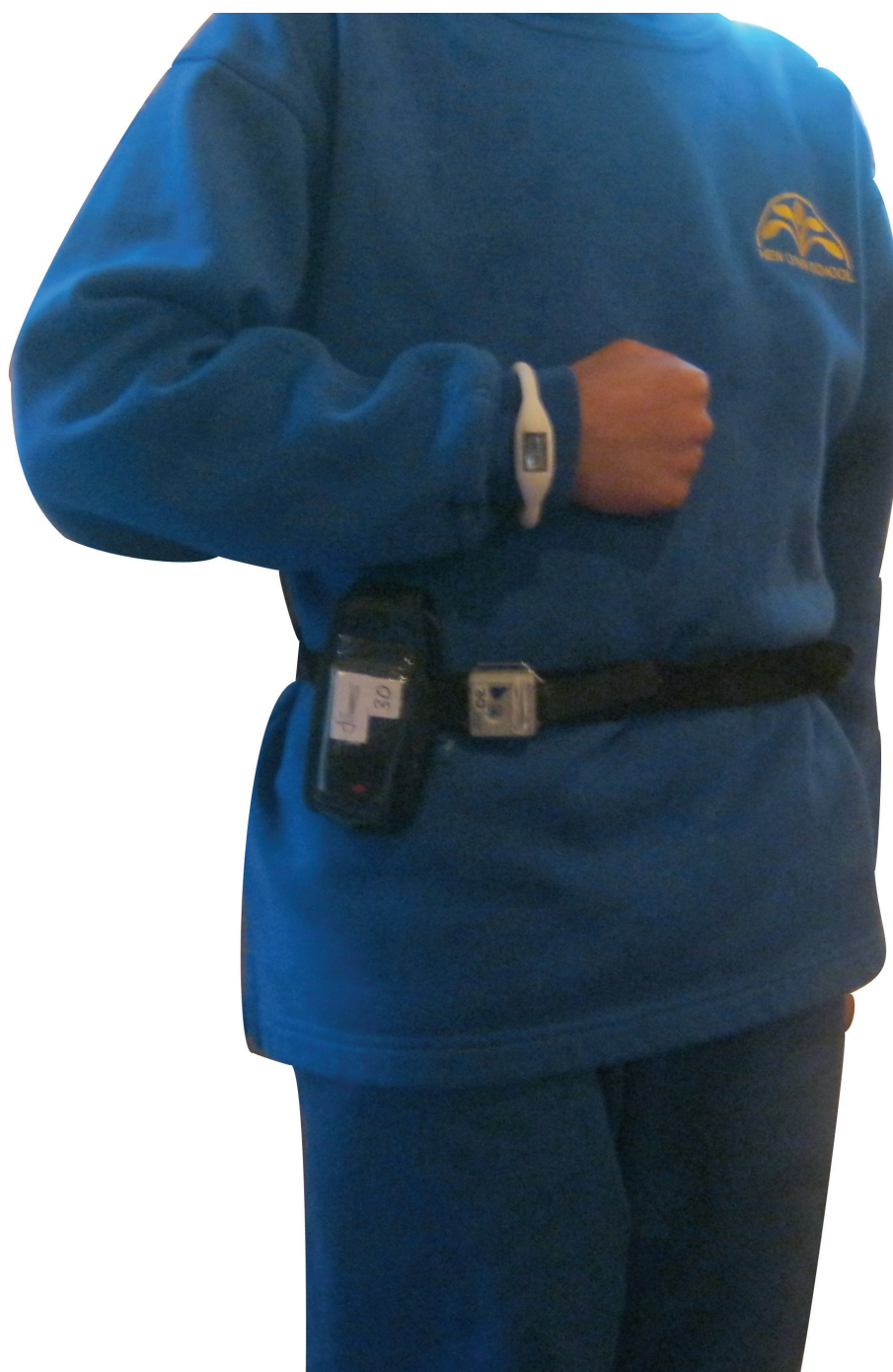
Figure 3 Image of children wearing their belts with GPS unit and accelerometer attached.

Height (shoes off) was assessed to the nearest 0.1 cm using a stadiometer (Mentone Educational Centre, Victoria, Australia) and weight (in light clothing) to the nearest 0.1 kg using calibrated Seca 770 scales (Protec Solutions Ltd, Wellington, New Zealand). Measures were repeated twice; if these measures differed by more than 0.5 cm or 0.5 kg for height or weight, respectively,