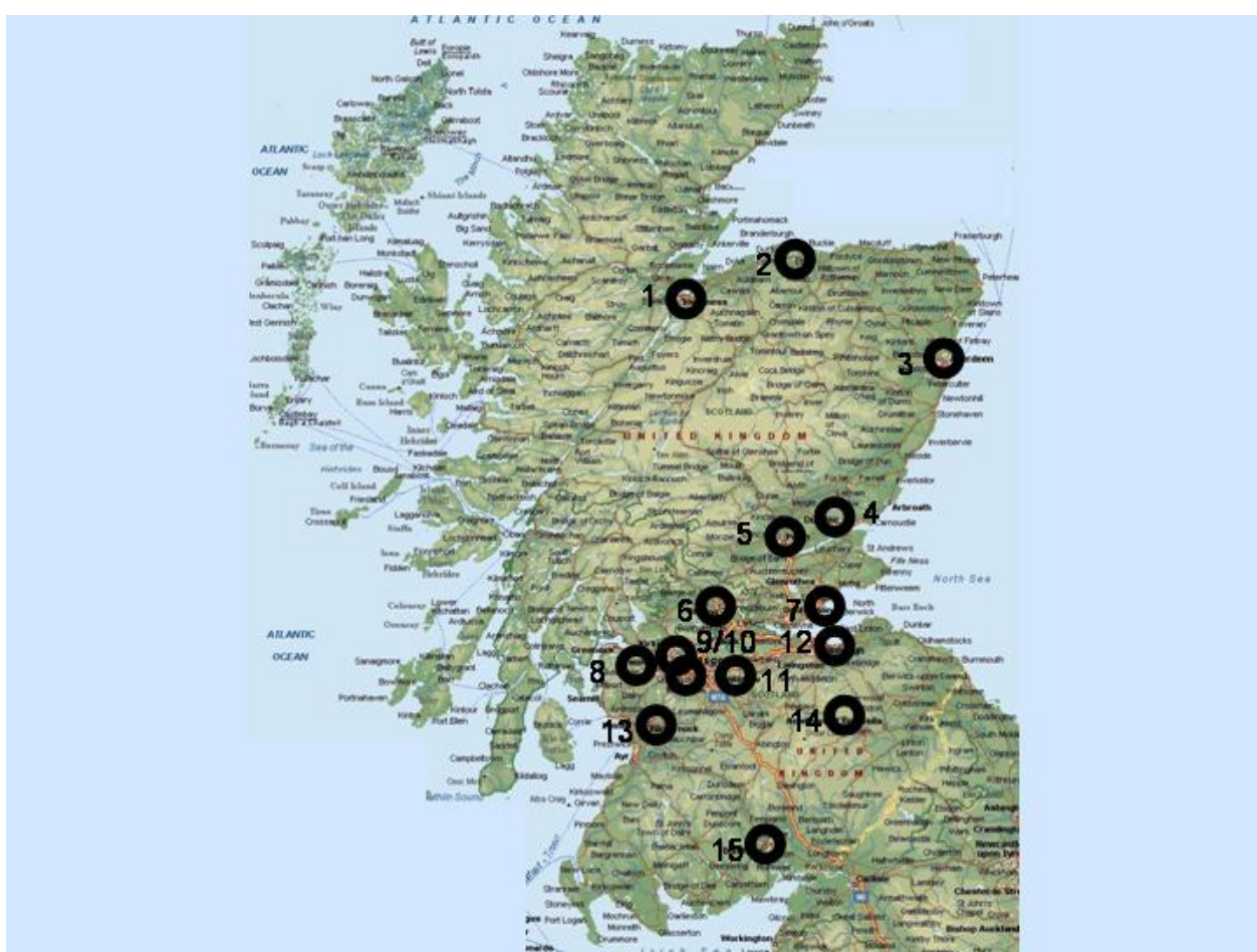
Figure 1 A map of Scotland identifying the recruitment centres. 1 = Inverness, 2 = Elgin, 3 = Aberdeen, 4 = Dundee, 5 = Perth, 6 = Stirling, 7 = Kirkcaldy, 8 = Paisley, 9/10 = Glasgow, 11 = Wishaw, 12 = Edinburgh, 13 = Kilmarnock, 14 = Melrose, 15 = Dumfries.

respiratory questions validated in the BREATHE study [6], questions relating to asthma control (the Child Asthma Control Test ® , used with permission) and environmental exposures (from Biobank). The Paediatric Asthma Quality of Life Questionnaire [7] and food frequency questionnaires (Scottish Collaborative Group semi-quantitative food frequency questionnaire version C1 http://www.foodfrequency.org ) were also completed by parents.