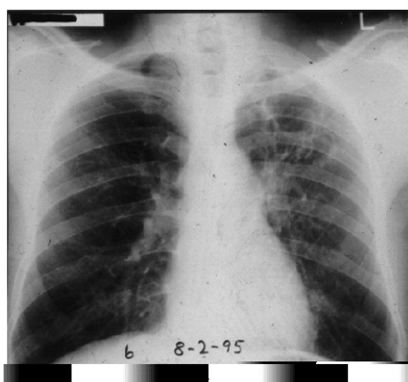
Figure 1: Chest radiograph of a patient with numerous positive cultures for M. kansasii , showing features typical of TB

# Adjusted for age, previous TB treatment, silicosis, years working underground and alcohol consumption