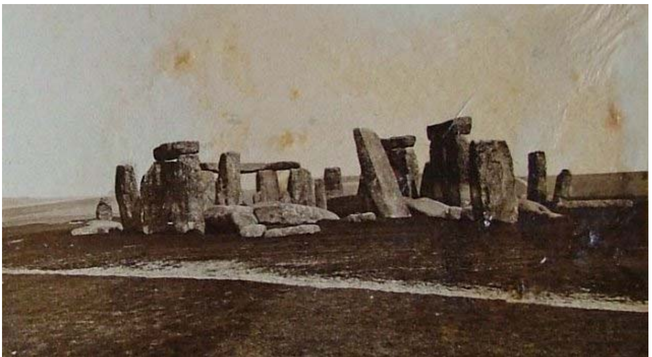
Fig. 3 Photograph of Stonehenge taken in 1877