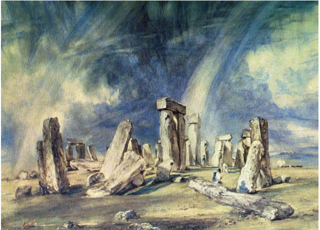
Fig. 2. 'Stonehenge, Wiltshire' by John Constable (1836). Victoria and Albert Museum.