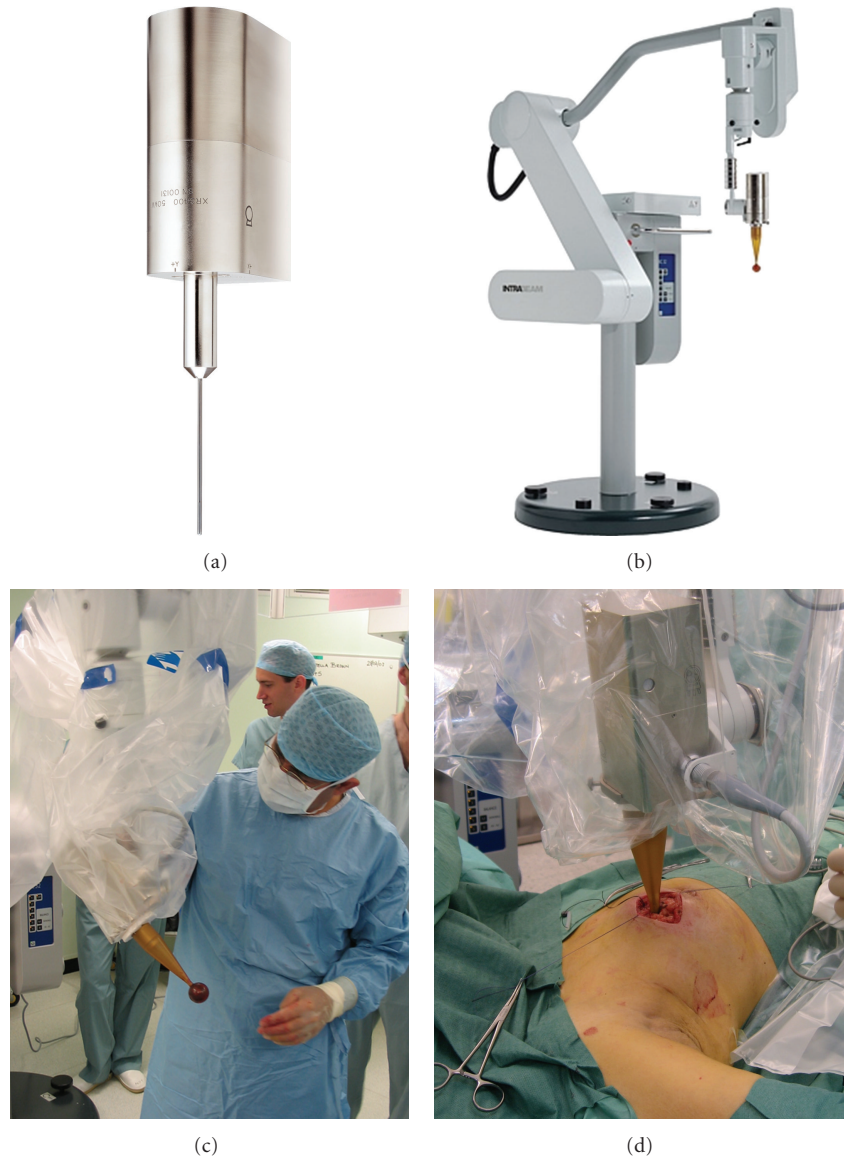
FIGURE 1: (a) The portable X-ray accelerator (Intrabeam). Soft X-rays are produced at the tip of the drift tube. (b) The intrabeam device mounted on the stand. The unit is portable and can be moved into the operating theatre as and when required. (c) Sterile drape and applicator in place, ready for positioning by the surgeon. (d) The applicator has been placed in the tumour bed and a purse-string suture is being applied to ensure conformity of the tissue to the applicator.

At 4 years, there were six local recurrences in the TARGIT group and five in the external beam radiotherapy group. The Kaplan-Meier estimate of local recurrence in the conserved breast at 4 years was 1.20% (95% CI 0.53–2.71) after TARGIT compared with 0.95% (0.39–2.31) in the external beam radiotherapy group; the difference between the groups was not significant. The frequency of any complications and major toxicity was similar in the two groups, and radiotherapy toxicity was lower in the TARGIT group. The results of this study provide level-1 evidence that, for selected patients with early breast cancer, a single dose of radiotherapy delivered at the time of surgery using the TARGIT technique should be considered as an alternative to external beam radiotherapy delivered over several weeks.