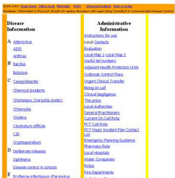
Figure 1 Structure of the on call pack as viewed on a PDA