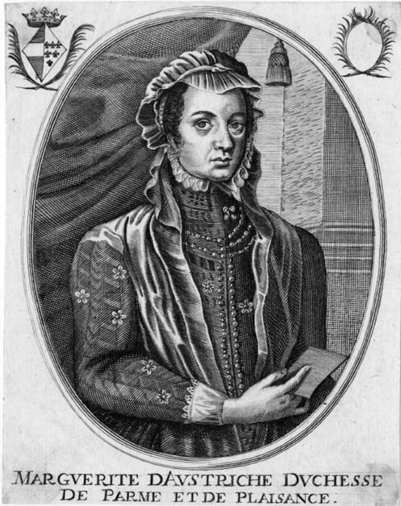
Margaretha van Parma (Margaret of Austria, Duchess of Parma and Plaisance), governor of the Netherlands, 1559–67 and 1578–82.