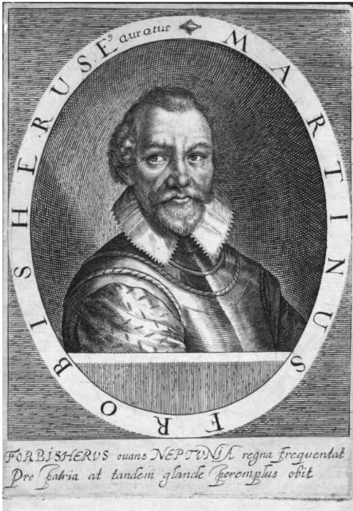
Martin Frobisher (knighted in 1588), privateer and explorer.