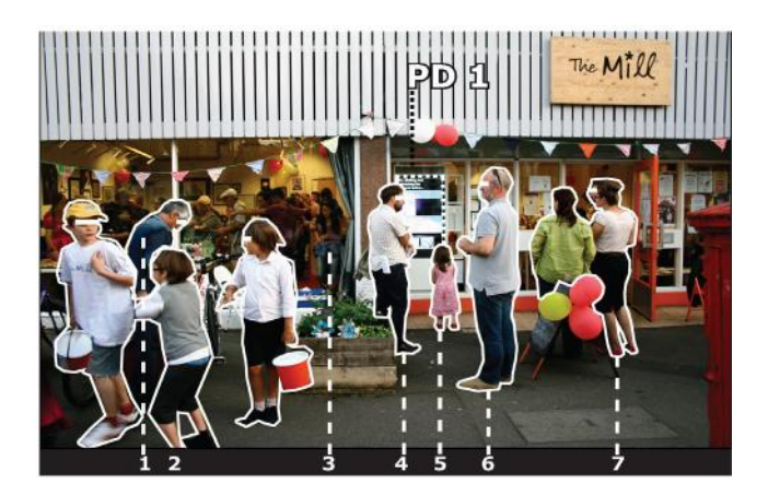
Fig. 1 Simultaneous interactions: (1) man locking bike, (2) children collecting donations, (3) people inside the building, (4) man observing a group, (5) child watching live video feed, (6) man looking into distance, (7) group watching the screen.

The Mill hosted a large event celebrating their first anniversary on September 6<sup>th</sup>, 2012. As part of this occasion we promoted interactions through our networked public display. The event was announced as 'family friendly celebrations' from 4pm until 9pm. During this time the local community gathered and contributed through bringing their own food to share. Various activities for all age groups were offered such as music performances, an art exhibition or make-up sessions for kids. Fund raising was running in parallel as well.